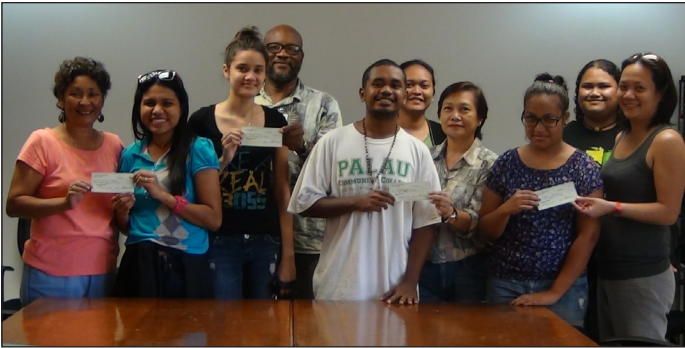
Members of FSA and Scholarship Recipients during the FSA Scholarship Spring 2014 Presentation.