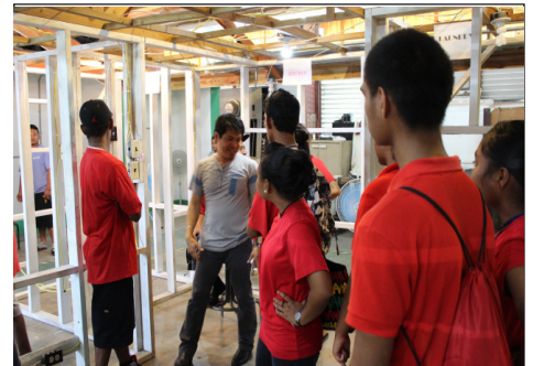
ET instructor demonstrate residential wiring to PHS students.