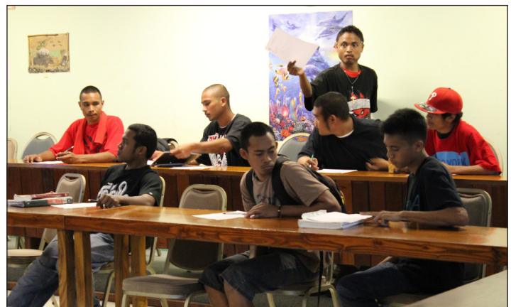
Students attending the Financial Aid sessions.

All through last week the Financial Aid & Admissions Office of Palau Community College (PCC) held sessions with students. Students were divided into groups based on home islands and last names. On each day, a different group met with the Financial Aid Staff at the Continuing Education (CE) Training Room to discuss the financial aid renewal process.