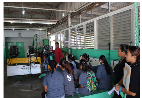
PHS students tour Small Engine and Outboard Motor.