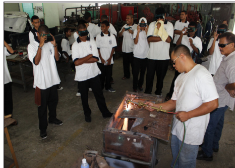
Welding Student & Instructor demonstrate the use of proper and safe Oxygen and Acetylene.