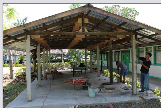
New student study area currently being built.

Palau Community College is an accessible public educational institution helping to meet the technical, academic, cultural, social, and economic needs of students and communities by promoting learning opportunities and developing personal excellence.