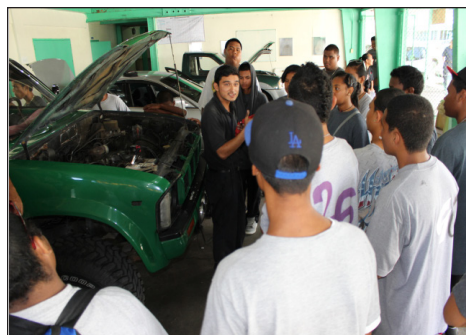
Students get a first hand look at Automobile Engine Diagnostic.