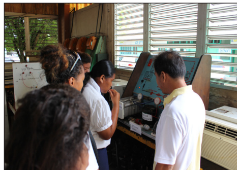
Students at Air Conditioning & Refrigeration