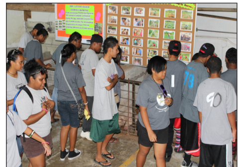
Students tour Agriculture Program