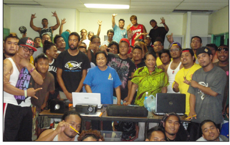
Students with the guest speakers after presentations about climate change.