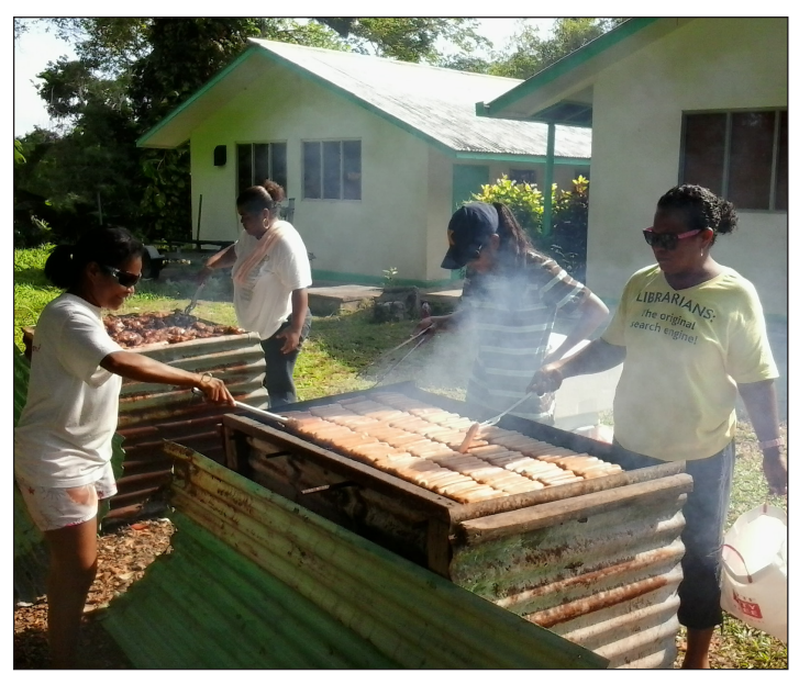
Volunteers preparing the lunch plates during the PAL Fundraiser.

PAL will be holding BBQ Lunch Plate fundraisers each month up until the conference in November. The next fundraiser is scheduled for April 17, 2014. Come to the Tan Siu Lin PCC Library to buy your $5 ticket or call (488-3540) for more information!