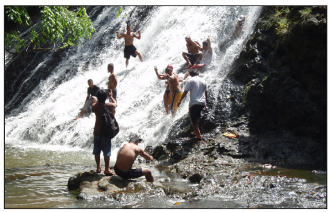
PCC students enjoying the morning at Students enjoying a movie night at the CRE Tabcheding Waterfall.