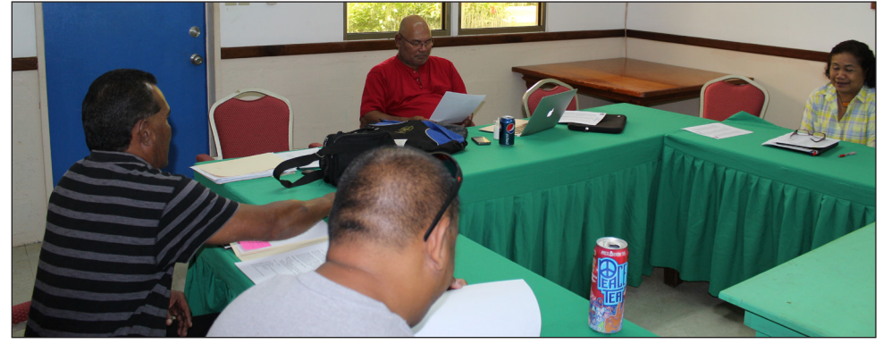
Members of the Charter Day Committee busy at work preparing for the celebration.

The committee in charge of the Palau Community College (PCC) 20th Charter Day celebration met again to finalize the activities for the event. Activities included in the celebration are a 50-Meter Relay Race, Target-Spearing, a Three-Legged Race, Target-Throwing, Coconut Husking, Coconut Grinding, Balloon Tossing, Musical Chair, and Dizzy-Izzy. A Fishing Derby has also been planned for the staff, faculty, and students of the college. At the end of the day teams will be awarded first, second, and third place trophies based on the overall team standings. The committee also finalized the starting time and registration time for the traditional President's Walk/Run race. The 20th PCC Charter Day celebration is set for Friday, April 04, 2014. The entire college, from Trustees to staff to students, have been divided into six teams. Find out what team you are on by visiting the campus bulletin boards.