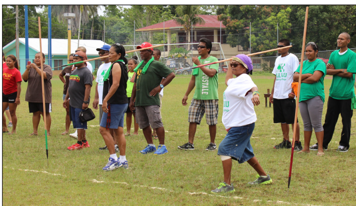
Teams competing in the Target Spear Throw competition.