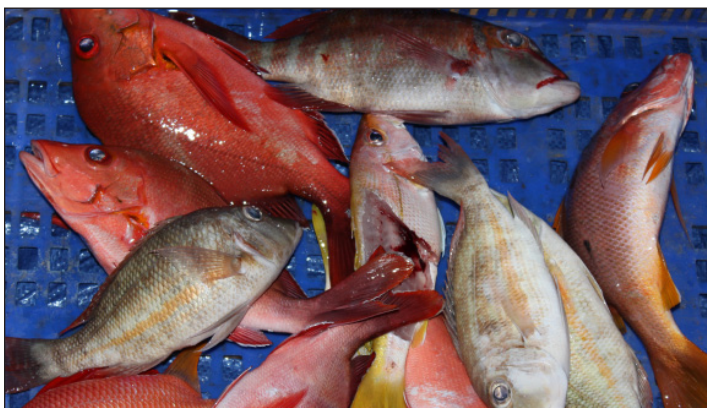
Fish caught during the Fishing Derby on Wednesday evening.