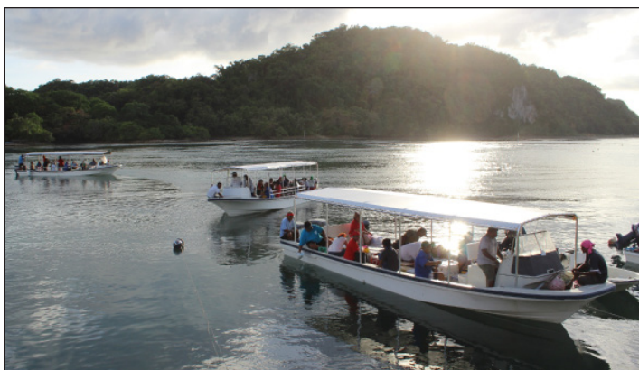
Teams at M-Dock during the Fishing Derby on Wednesday evening.