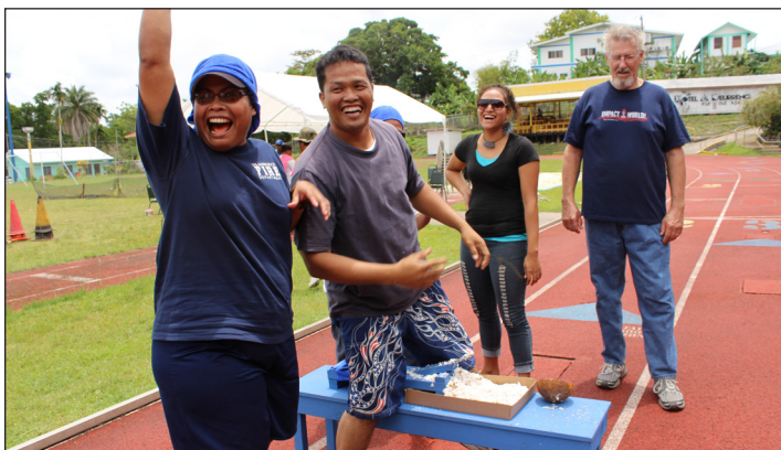
Team Blue cheering after completing the Coconut Grating challenge.