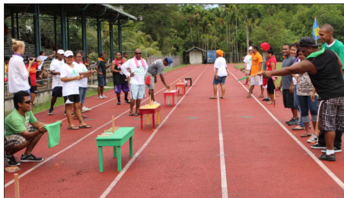
Team Green during the Rubber Shooter - Target Shoot event.