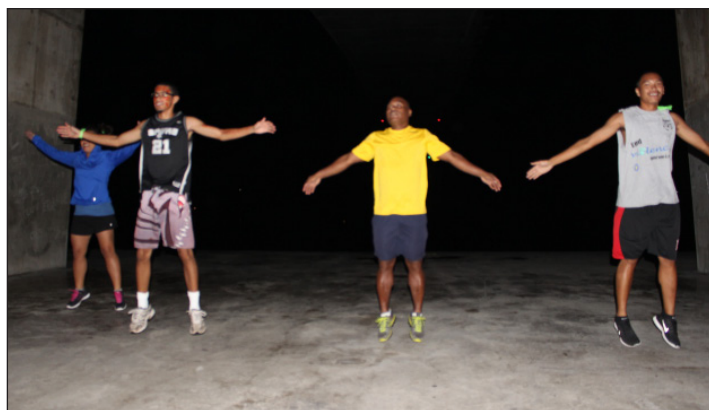
Warm-Up Exercises before the President's Walk & Run.