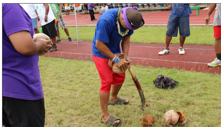
Team Purple during the Coconut Husking activity.