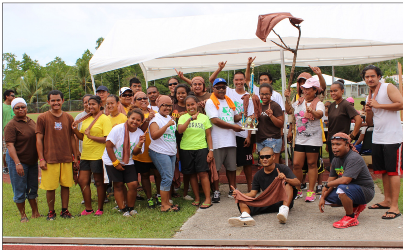
Congratulations to the winners of the first place trophy: Team Brown!

Today marks the 20 th Charter Day celebration of Palau Community College (PCC). The theme for today was “Strength through Diversity and Teamwork” celebrating the diversity of the PCC family which includes its faculty, staff, and students. Over 180 people participated in the annual President’s Walk & Run which began at the Japan-Palau Friendship Bridge and ended at the Palau National Track & Field.