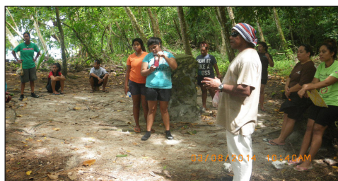
Koror Guide portrays site history.