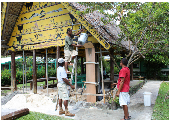
Maintenance workers renovating the PCC Mesekiu Bai.

Mesekiu Bai, a prominent fixture on the Palau Community College (PCC) Campus, is currently undergoing renovation. The renovation entails replacement of wooden posts with concrete, replacement of wooden benches, repair of the thatch roof, and re-touching of the painting of local legends on interior beams and outside gables. Thanks to the Maintenance Crew for their hard but delicate work!