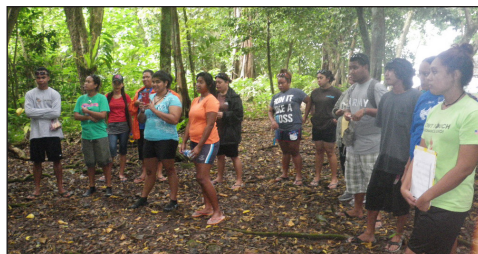
Students on a trail that leads to Ollumel.