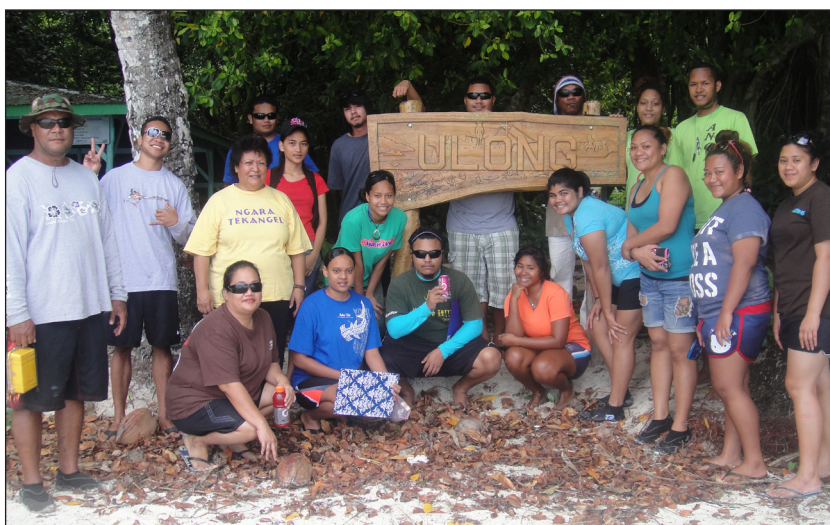
HI-189: Palauan History & Culture and TH-110: Tour-Guiding & Travel Planning students at Ulong Island with their instructors and Koror State guides.