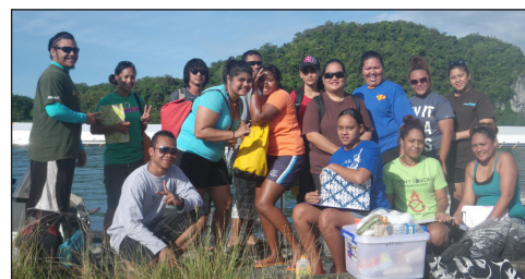
Students break for a photo op.