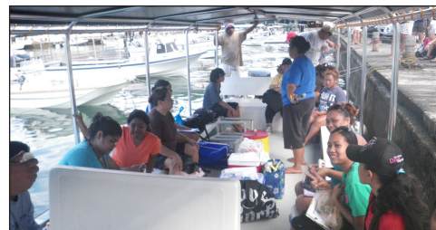
Students on the boat ready for the field trip.