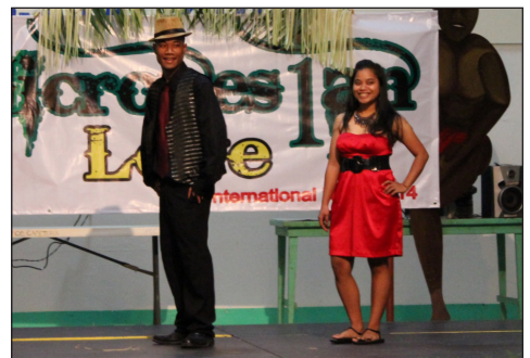
Modern attire of the Marshall Islands.