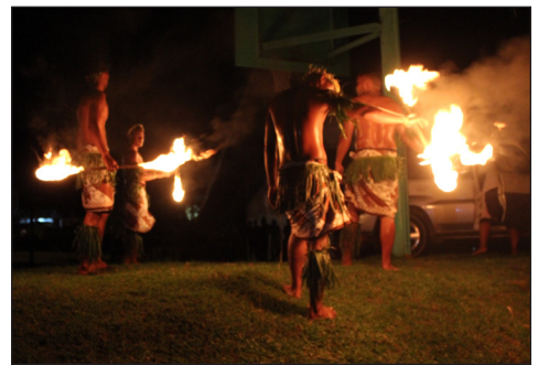
Yapese fire dancers.