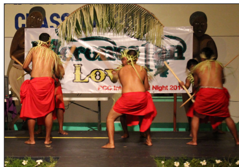
Chuukese stick dancers.