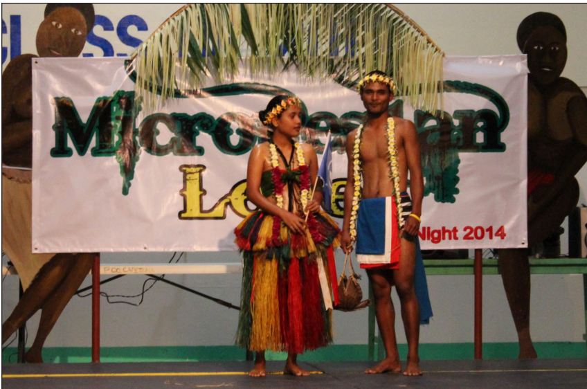
Yapese students presenting their traditional attire during the fashion show.

On Friday, April 11, 2014 the Associated Students of Palau Community College (ASPCC) hosted an International Night at the PCC Cafeteria. The International Night promoted the theme of "Micronesian Love" which embraced and celebrated the diverse Micronesian population of the college.