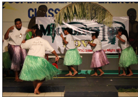
Palauan contemporary dancers.