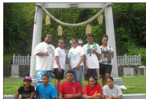
Students at a Japanese Shrine in Peleliu.