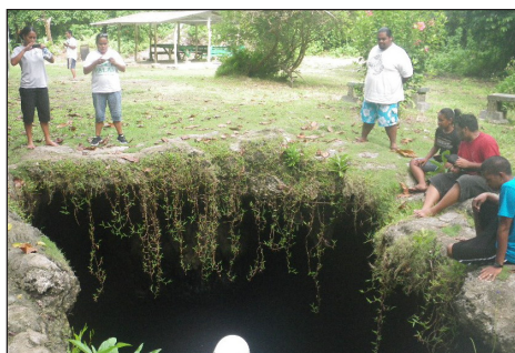
Students at Ngermelt.