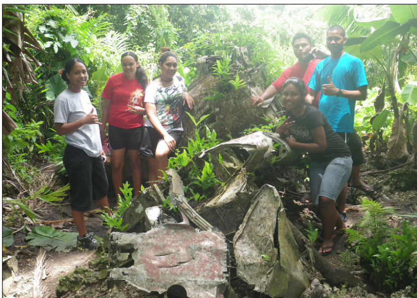
Tourism & Hospitality students with the remnants of the Japanese Zero Plane.