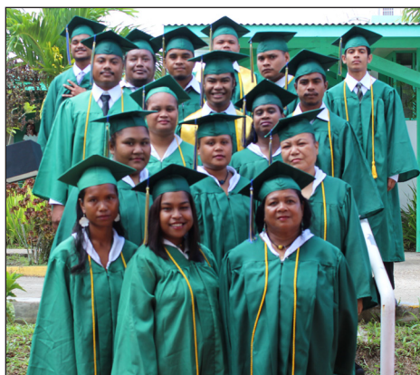
PCC Adult High School - Class of 2014