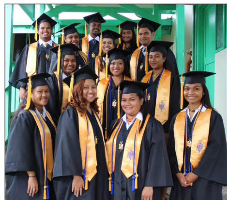
Phi Theta Kappa Honor Society