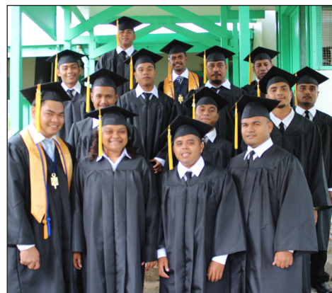
School of Technical Education - Class of 2014