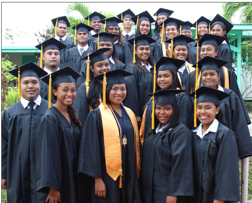
2014 Graduates of the Palau Community College - School of Arts & Sciences

Palau Community College (PCC) celebrated its 51 st Commencement Exercises last Friday, May 23, 2014. The ceremony was held at the PCC Cafeteria - Belochel Building and recognized the academic achievements of ninety-six (96) graduates.