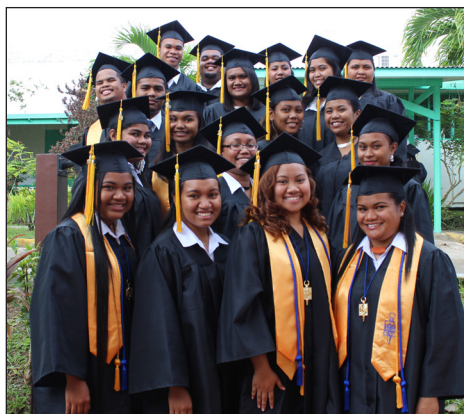
School of Business - Class of 2014