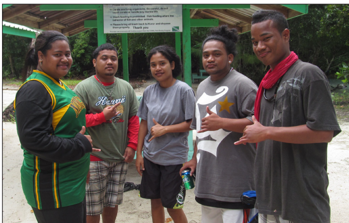
Members of ASPCC at their retreat on Ngchelobel island.