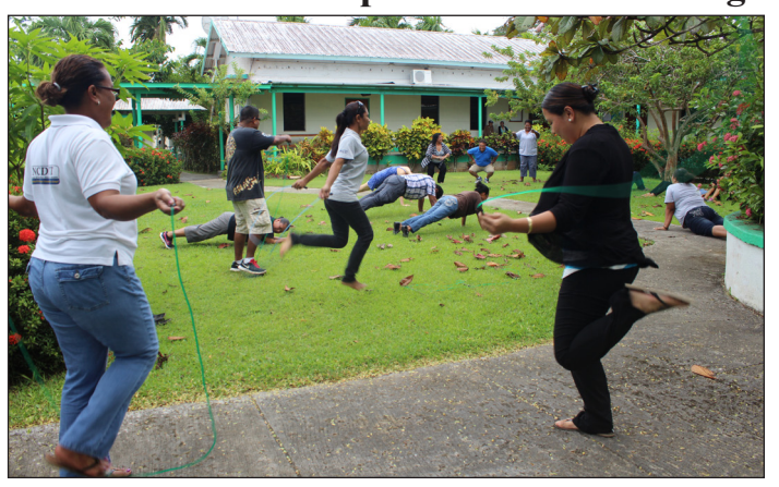
Participants of the EpiTech Training having a de-stressing session.

Another training session under the second Pacific Islands Preparedness and Emergency Response (PIPER) Summit was held at the Palau Community College (PCC) Assembly Hall from June 30, 2014 to July 04, 2014. The EpiTech Data for Decision Making: Disease Outbreak Surveillance & Response Training was facilitated by instructors from the Pacific Islands Health Officers' Association (PIHOA), the Palau Ministry of Health (MOH), the United States Center for Disease Control and Prevention (US CDC), the United States Association of State & Territorial Health Officials (US ASTHO), and the World Health Organization (WHO).