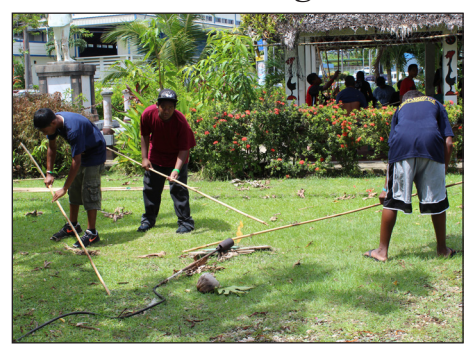
Summer Kids Program participants learning Palauan spear-making.