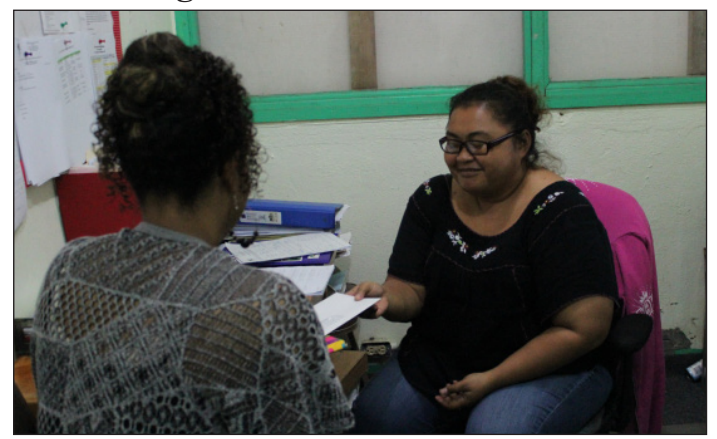
A student meeting with her counselor during pre-registration day.

Continuing students from the Palau Community College (PCC) Spring 2014 and Summer 2014 semesters had pre-registration sessions this week. On Monday, July 07, 2014 and Tuesday, July 08, 2014, students met with their counselors at the Student Life Office to prepare for the upcoming fall term. During their meeting with the counselors, continuing students updated their educational goals at PCC and chose classes for the new semester. Continuing students who registered for their fall semester also received their official class schedules for the new term.