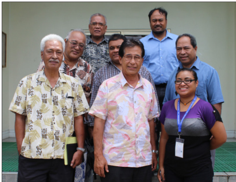
President Mori (front, center) and the FSM Delegation attending meetings at PCC.

Palau Community College (PCC) hosted meetings for the Pacific Islands Forum beginning with the Small Islands Forum on Tuesday, July 29, 2014 and ending with the Post-Forum Dialogue on Friday, August 01, 2014. Leaders of the small island states met with key dialogue partners as well as other island nation leaders to discuss regional issues, such as the Framework of the Pacific Regionalism and the Third International Conference of the Small Islands Developing States. The bilateral meetings were held at the PCC Assembly Hall, the Conference Room of the Tan Siu Lin Library, the PCC Conference Room, Chibokill Building, the PCC Cafeteria, and college classrooms of the Sebus and Smuuch buildings.