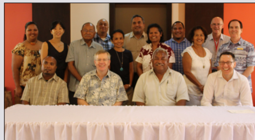
Australian delegation with representatives from PCC and the Belau Tourism Association (BTA).