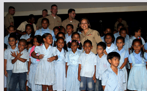
Members of the US Marine Forces - Pacific Rock Band with students from Koror Elementary School.

On Monday, September 15, 2014 the United States Marine Forces – Pacific Rock Band performed at Palau Community College (PCC). The rock band performed in the morning at the PCC Orchestra Room to an audience comprised of Koror Elementary School students, PCC students, and members of the community. Another performance was held that night at the PCC Cafeteria. The performance sets included covers of songs such as “Titanium” by David Guetta featuring Sia, “Ain’t It Fun” by Paramore, “Aeroplane” by the Red Hot Chili Peppers, “Carry On My Wayward Son” by Kansas, and “Santeria” by Sublime. The Marines Pacific Rock Band was part of the United States Marines Pacific Band ensemble invited to perform for the Battle of Peleliu anniversary. The ensemble also included a big band, an orchestra band, and a jazz band.