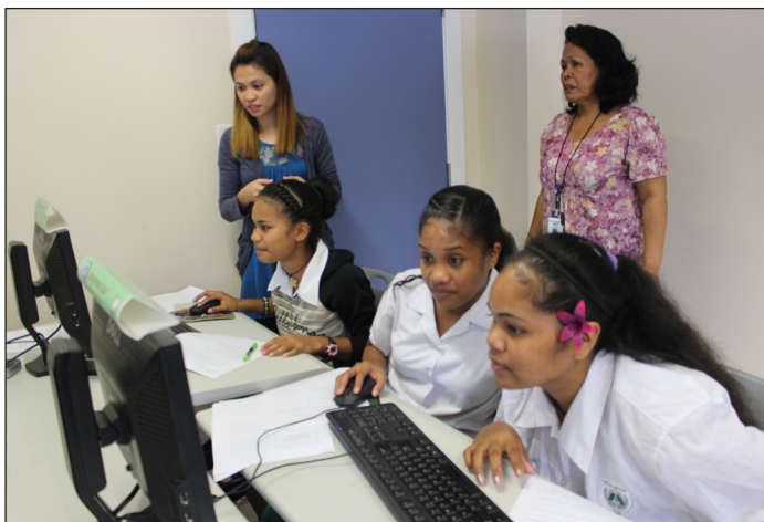
Bethania High School students learning about accessing the online archives of books, journals, magazines, and other library materials.