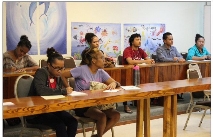
Students attending a financial aid session at the CRE Training Room.

In the month of September, students of Palau Community College (PCC) attended financial aid sessions hosted by the staff of the Financial Aid & Admissions Office. The sessions covered topics such as financial aid eligibility requirements and the number of credits covered by financial aid. Students attending the sessions were required to sign agreements that confirmed their understanding of the financial aid requirements and their responsibility of maintaining acceptable academic standings.