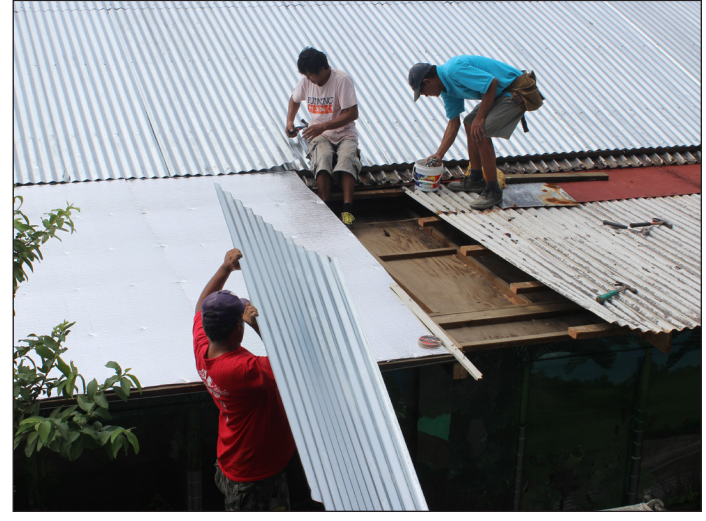
Workers roofing and repairing the college buildings with newer materials while adding insulation.

The past few weeks, the buildings on the campus of Palau Community College (PCC) underwent renovations. The photo above shows workers diligently replacing old roofs with new material. In addition, insulation was added to the buildings to help sustain temperatures during days of heat and rain.