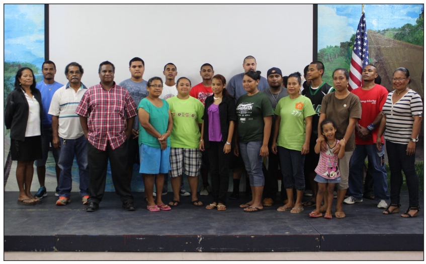
Students and their parents attending the Educational Talent Search workshop.

Palau's high school senior students participating in the Educational Talent Search Program attended a budgeting workshop on Thursday, October 23, 2014. The workshop, which focused on budgeting and financial planning, was held at the Palau Community College (PCC) Assembly Hall. Also in attendance were the parents of the students and the Educational Talent Search Office staff.