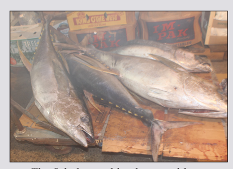
The fish donated by the patrol boat.

The Palau Community College (PCC) received a fish donation from the Marine Law Enforcement Division Patrol Boat on October 21, 2014. The fish donation included nine (9) yellow fin and three (3) blue marlins. PCC would like to thank Officers of the Patrol Boat for their donation!