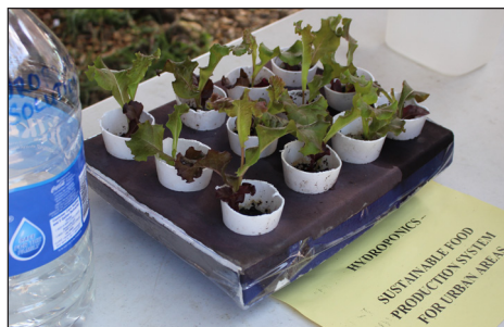
Hydroponics - A Sustainable Food Production System for Urban Areas