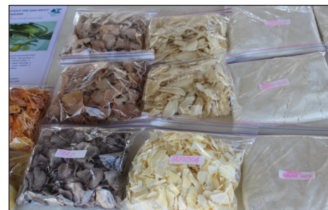
Chips, starch, and flour made from locally grown tapioca & taro