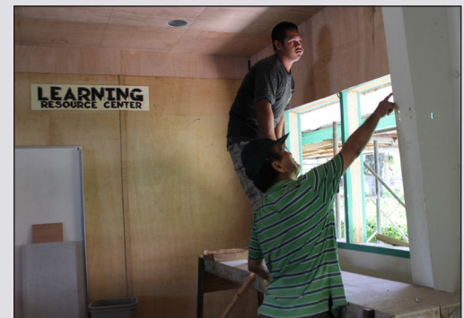
PCC maintenance workers diligently working to renovate and improve the LRC facility

The Learning Resource Center (LRC) of Palau Community College (PCC) is currently undergoing renovations. The room that serves as a study area is being rewired and its floor is being replaced. In addition, the walls were stripped away and replaced with better material. Palau Community College would like to thank the maintenance workers for improving the tutoring facility. The Learning Resource Center is an important part of the college. It provides academic & non-academic services that identify and support student learning. The center offers tutoring sessions, PCC placement testing, institutional TOEFL testing, and counseling for students transferring to four-year universities/colleges. LRC also administers the Asian American and Native American Pacific Islander Serving Institution (AANAPISI) program.