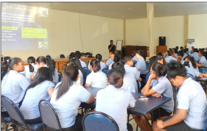
Office of Admissions & Financial Aid Representatives holding a recruitment session with students from Palau High School (PHS)

For more information or inquiries regarding Admissions & Financial Aid for the 2015-2016 School Year, contact the Office of Admissions & Financial Aid at 488-2470, ext. 235.