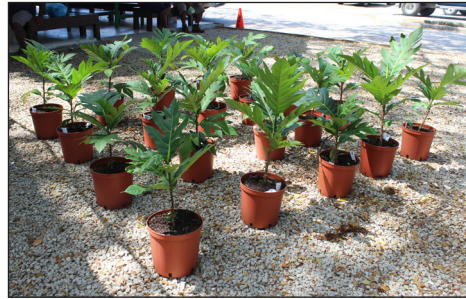
Breadfruit plants, grown by CRE, that were awarded to raffle drawing winners