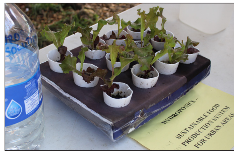
Hydroponics - A Sustainable Food Production System for Urban Areas