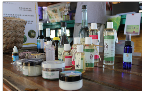
Local products made from local ingredients showcased by the Belau National Museum