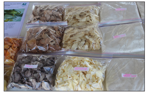
Chips, starch, and flour made from locally grown tapioca & taro