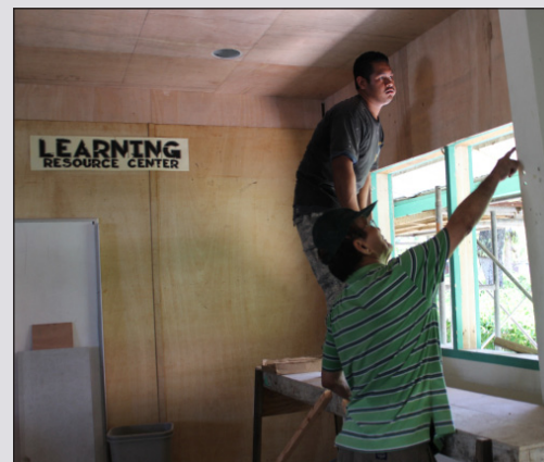
PCC maintenance workers working to renovate and improve the LRC facility

The Learning Resource Center (LRC) of Palau Community College (PCC) is currently undergoing renovations. The room that serves as a study area is being rewired and its floor is being replaced. In addition, the walls were stripped away and replaced with better material. PCC would like to thank the maintenance workers for improving the tutoring facility. The Learning Resource Center provides academic & non-academic services that identify and support student learning. The center offers tutoring sessions, PCC placement testing, institutional TOEFL testing, and counseling for students transferring to four-year universities/colleges. LRC also administers the Asian American and Native American Pacific Islander Serving Institution (AANAPISI) Program.