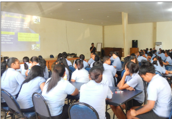
Recruitment session with students from Palau High School (PHS)

For more information or inquiries regarding Admissions & Financial Aid for the 2015-2016 School Year, contact the Office of Admissions & Financial Aid at 488-2470, ext. 235.