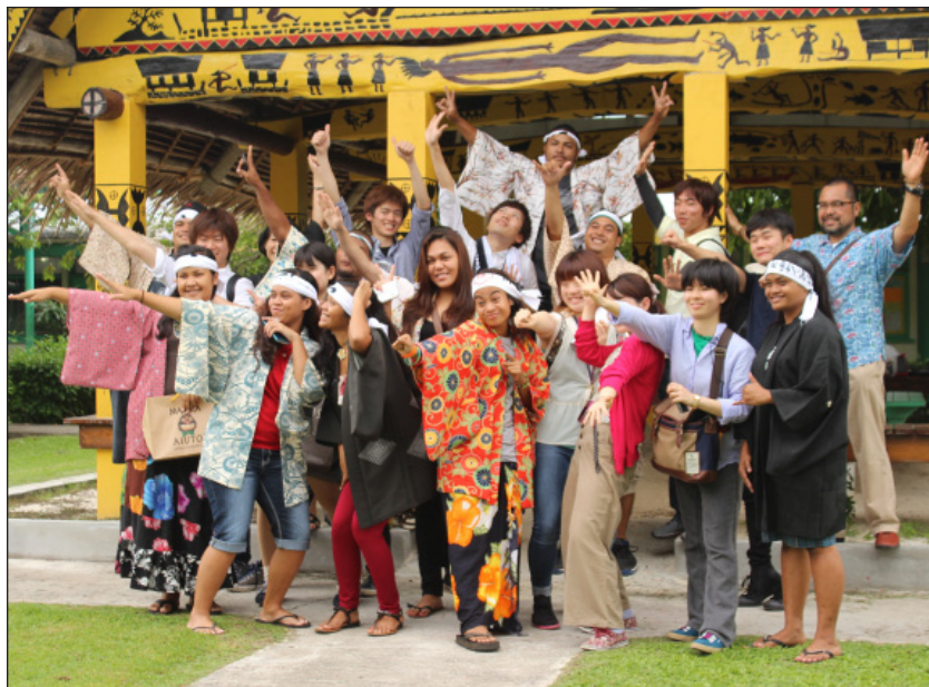
PCC and Ryukoku Daigaku students posing in front of the Mesekiu Bai