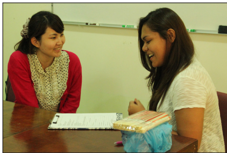
A PCC and Ryukoku Daigaku student sharing an exchange about their cultures