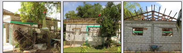
Different views of the new Tutau Building

A new building is currently being built on the campus of Palau Community College (PCC). Located next to the PCC dormitories and cafeteria, the Tutau Building is a renovation of an old office/classroom. It will serve as a housing unit for the college staff.