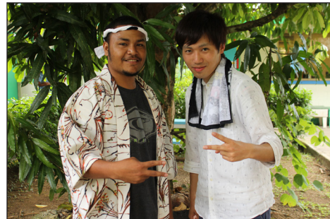
A PCC student and a student from the Ryukoku Daigaku posing for the camera