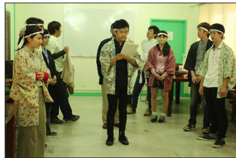
Ryukoku students performing a traditional Japanese dance about a fisherman