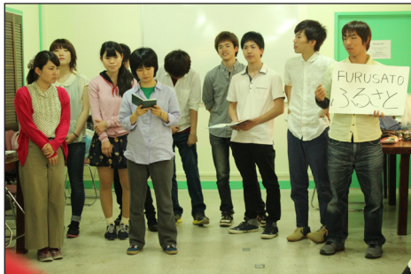
Ryukoku Daigaku students singing a Japanese folk song entitled "Furusato (Hometown)"