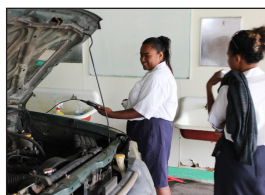
Scenes from the 2014 Career & Technical Education Week

Palau Community College (PCC) will be hosting the annual Career & Technical Education (CTE) Awareness Week on March 18, 2015 to March 20, 2015. The awareness week is an opportunity for the college to showcase and promote its programs to elementary/high school students as well as the community.