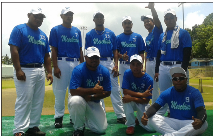
The Palau Community College (PCC) Mesekiu Baseball Team

On Saturday, February 27, 2015 the Palau Community College (PCC) baseball team played and won the season opener against the defending champions, the Airai Aces, in extra-innings by a score of 11-9.