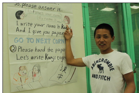
A Japanese student teaching participants common Japanese introduction phrases