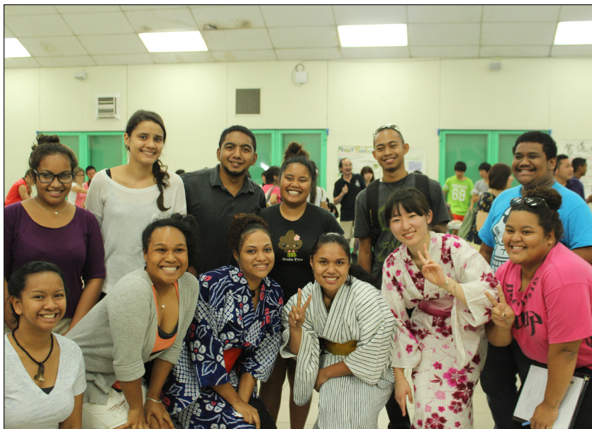
PCC students enjoying the Japanese Cultural Fair at the PCC Cafeteria

On Friday, March 06, 2015 a Japanese Cultural Fair was hosted at the Palau Community College (PCC) Cafeteria. The fair featured stage performances and booths that represented different aspects of the Japanese culture. Students from the Ritsumeikan High School in Japan and their chaperones organized the event.