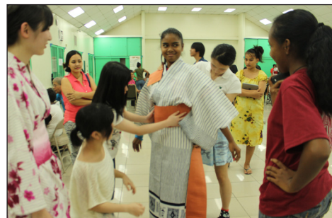
A Palauan student wearing a Japanese traditional outfit called a Kimono