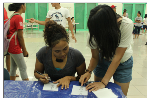
A PCC student learning how to write her name in Kanji