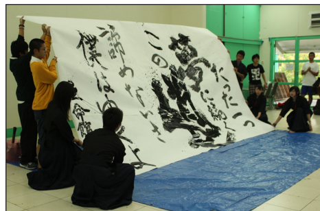
A Shodō Performance that portrayed the Japanese art of calligraphy