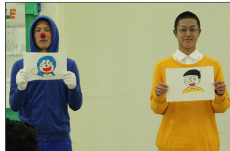
Japanese students putting on a play about a Japanese anime called "Doraemon"