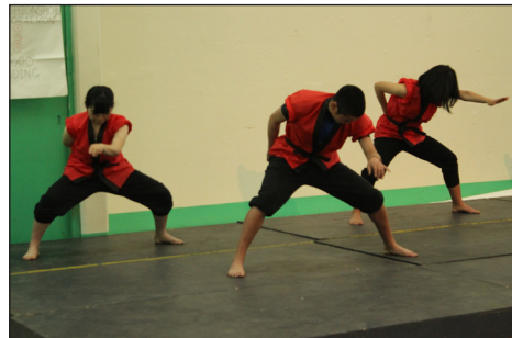
Japanese students performing a traditional dance about fishermen called "Sōran Bushi"