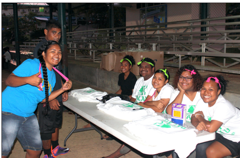
PCC students registering for the "President's Run & Walk" Event

Today marks the 21 st Charter Day of Palau Community College! In celebration, PCC hosted its annual "President's Run & Walk" Event. This morning, runners and walkers gathered at the Palau National Track & Field to register for the run & walk. The course began at the Palau National Track & Field, circulated the President of the Republic's Office in Meyuns, and ended at the national track & field.