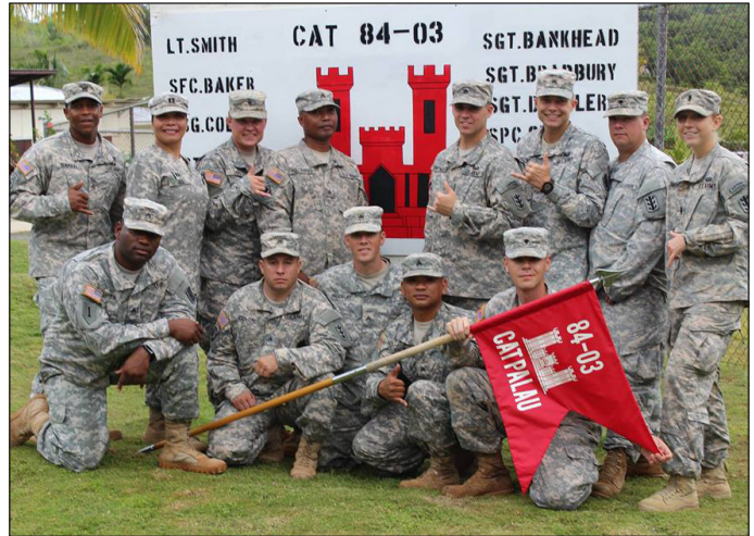
Palau Civil Action Team (CAT) 84-03

Palau Community College (PCC) in collaboration with the Palau Civic Action Team (CAT) 84-03, Ministry of Health - Emergency Health Program, and the Palau Community Action Agency (PCAA) will be offering the Emergency Medical Technician (EMT) Training starting on Monday, April 06, 2015. The training will consist of three-hundred (300) hours and will continue until December of this year.