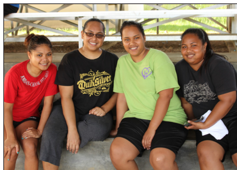
PCC staff members enjoying the Walk & Run

The 21 st Charter Day marks the inception date of Palau Community College. Since it began, PCC has continued to help students in Palau and the Micronesian region reach their best potential by providing quality service and educational programs. Palau Community College remains Palau's only institution of higher learning that produces students who have become assets to the community.