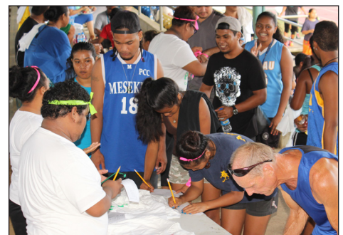
Walkers & runners receiving PCC shirts