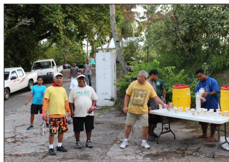
Participants enjoy refreshing break at Meyuns