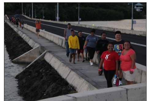
Walkers & runners heading to Meyuns