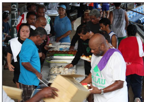
Complimentary breakfast for all participants