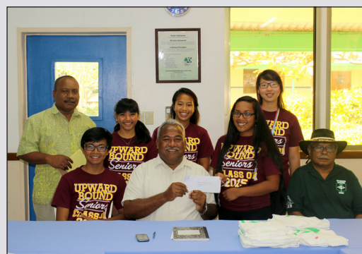
Guam Upward Bound students donating to PCC