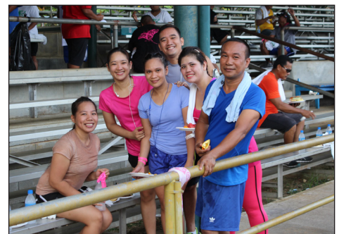
Participants resting after completing course