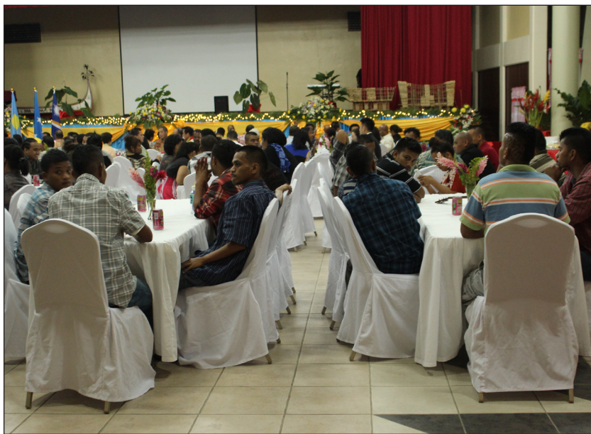
PCC students attending the state dinner at Ngarachamayong Cultural Center