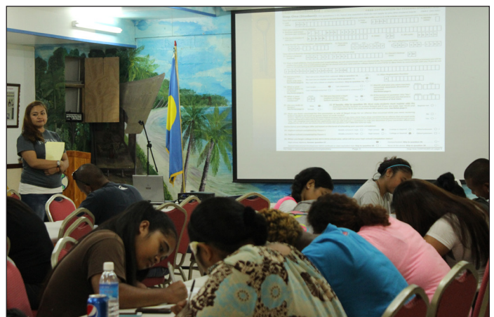
Students attending the financial aid meeting at the Assembly Hall

From Monday, April 13, 2015 to Friday, April 17, 2015 the Admissions & Financial Aid Office of Palau Community College (PCC) met with students to provide information about current financial aid updates and requirements. FINANCIAL AID, CONTINUED ON PAGE 3