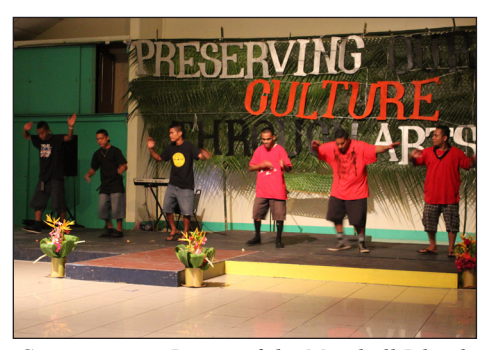
Contemporary Dance of the Marshall Islands