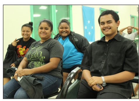
PCC students enjoying the performances