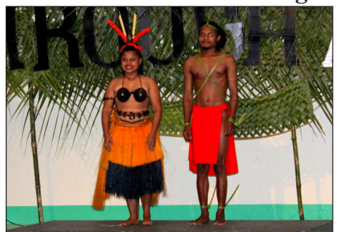
The traditional wear of Palau