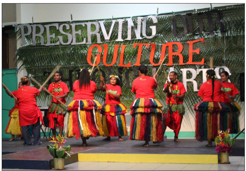
PCC students from Yap performing a traditional stick dance

On Friday, May 08, 2015 the Associated Students of Palau Community College (ASPCC) hosted its annual International Night in celebration of the end of the school year. The event featured performances that were coordinated and performed by the students of the college showcasing the talents of each island nation of Micronesia. The theme for the evening's event was "Preserving Our Culture Through Arts."