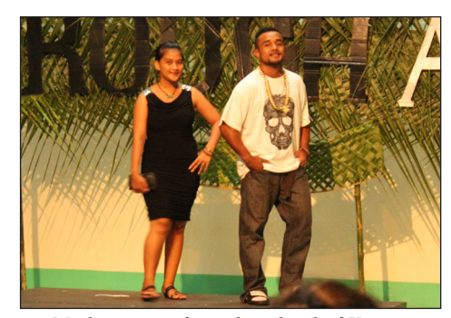
Modern wear from the island of Kosrae