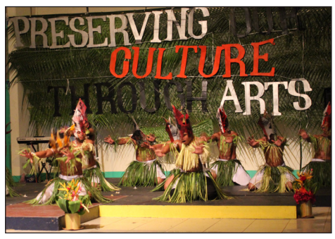
Traditional dance of Pohnpei