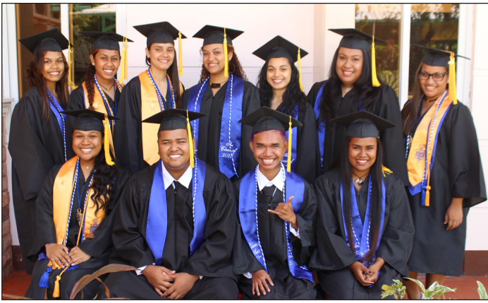
Liberal Arts Program