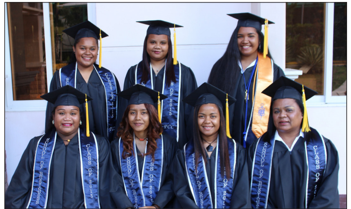
Office Administration Program