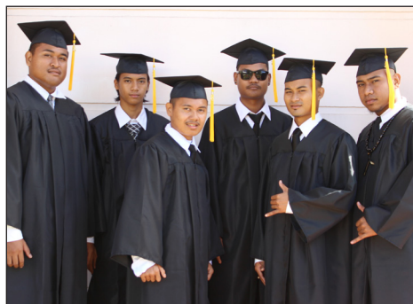
Automotive Mechanics Technology Program