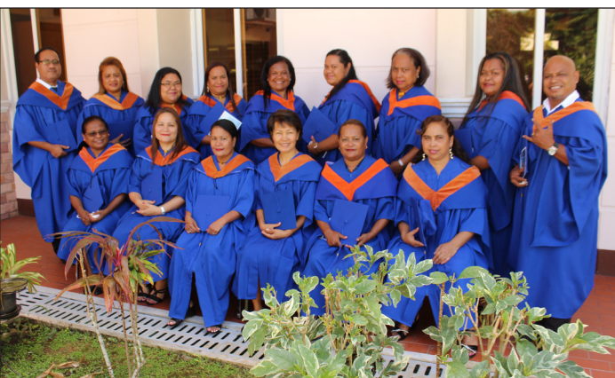
Fiji National University - Public Health Nursing Program