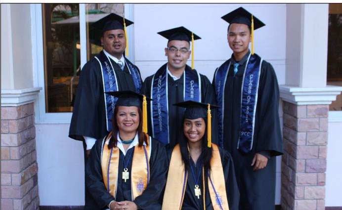
Business Accounting Program