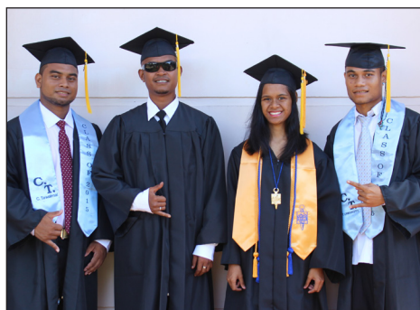
Construction Technology Program