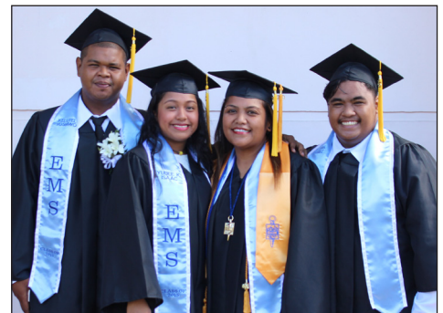
Environmental/Marine Science Program