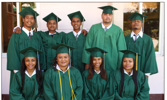
PCC Adult High School Class of 2015