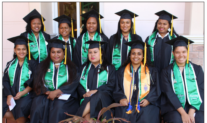
Nursing Career Ladder Program