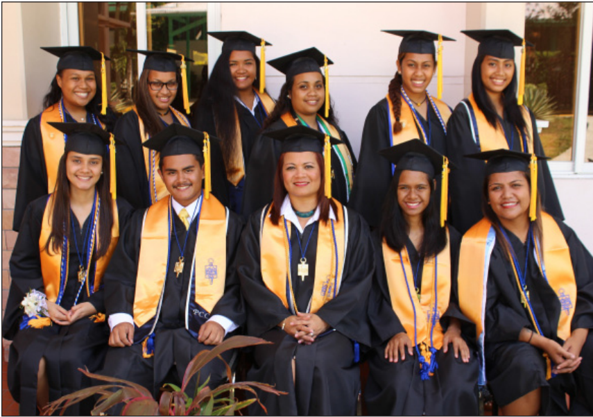
The graduating members of the Phi Theta Kappa International Honor Society

Palau Community College (PCC) held its 52 nd Commencement Exercises on Friday, May 29, 2015. A total of ninety-two (92) graduates were recognized for their academic achievements. Also recognized were the nine (9) graduates of the PCC Adult High School and the seventeen (17) nurses who completed the Public Health Program under Fiji National University.