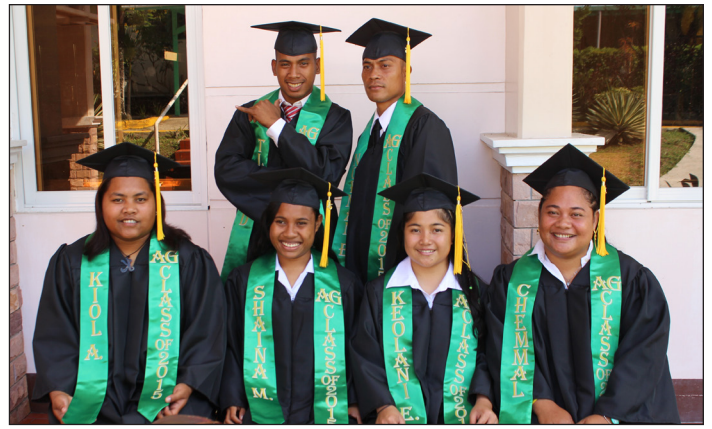
Agricultural Science Program