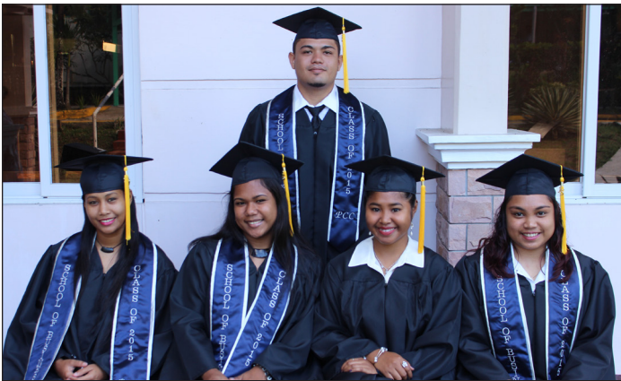
Tourism & Hospitality Program