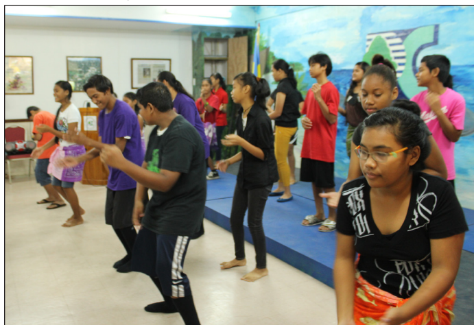
CE Summer Kids 2015 performing a Palauan contemporary dance

The last day of classes for the Continuing Education (CE): Summer Kids Program 2015 was Friday, July 03, 2015. Over the summer, elementary school students participating in the program attended classes that focused improving their skills in the subjects of mathematics, English reading, English writing, Palauan orthography, and marine science. Each class was designed to provide education activities that will enhance the students' learning skills and abilities.