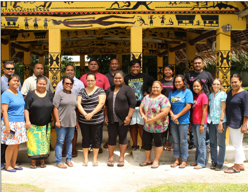
PCC Environmental/Marine Science Program faculty, program partners, and alumni