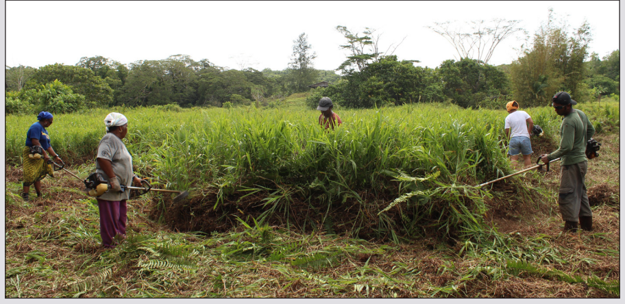
PCC Classified Staff Organization (CSO) cleaning the CRE: R&D Station in Ngeremlengui

On Saturday, July 11, 2015 the Classified Staff Organization (CSO) of Palau Community College (PCC) conducted a clean-up at the Cooperative Research & Extension (CRE): Research & Development Station in Ngeremlengui. CSO members spent the day clearing the land of debris as a part of their fundraising efforts. CSO would like to recognize and thank its members who participated in the clean-up session. Thank you all for your contribution!