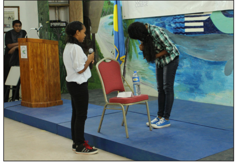
Upward Bound Program students showcasing their Japanese language skills