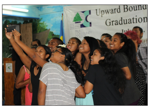
Upward Bound Program students enjoying the graduation banquet