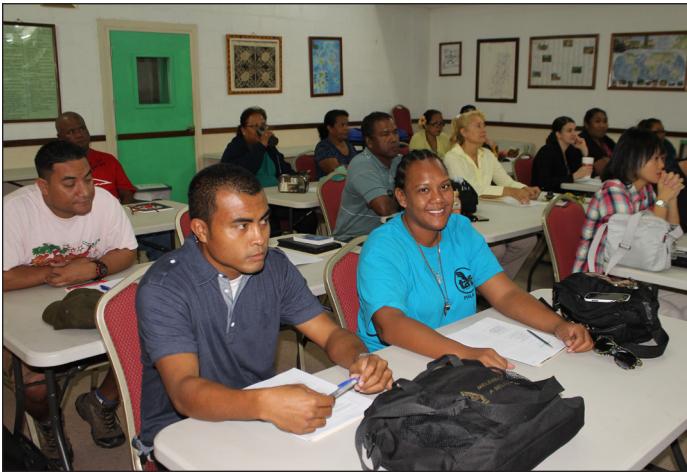
Faculty members participating in training at PCC Assembly Hall

On Tuesday, August 04, 2015 the faculty of Palau Community College (PCC) participated in an Institutional-Set Standards for Student Achievement (ISSA) Training held at the PCC Assembly Hall. Under the United States Department of Education: 34 Code of Federal Regulations and the Eligibility Requirements of the Accrediting Commission for Community & Junior Colleges (ACCJC), PCC must identify and establish institutional-set standards for student achievement.