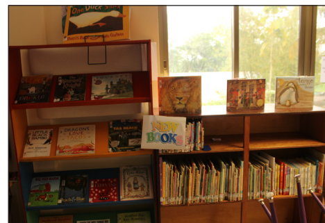
The new books added to the Children's Collection of the library