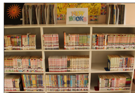
New collection of manga (Japanese comic books) displayed at the library