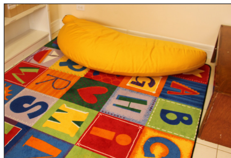
The new six-foot banana bean bag chair added to the library Kids' Corner