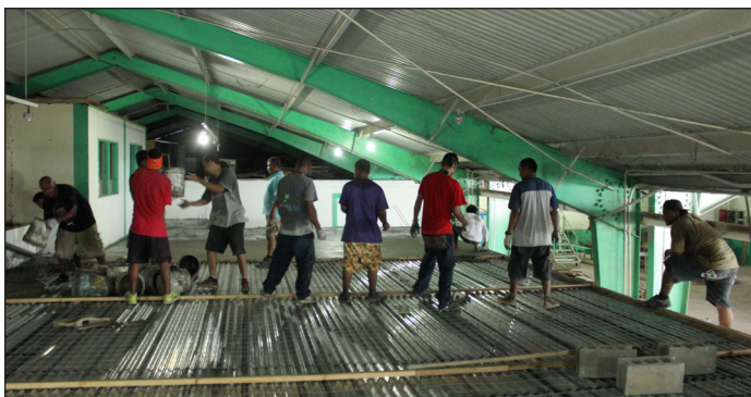
PCC students helping with the Carpentry Shop renovation

The Carpentry Shop of Palau Community College (PCC) is currently being remodeled. Last week, PCC students assisted the maintenance workers with cementing the upper-level of the work area as well as transporting materials. The remodeling project aims to improve the overall condition of the carpentry workshop and provide students with a safer learning environment. PCC would like to thank the students for their help with the project.