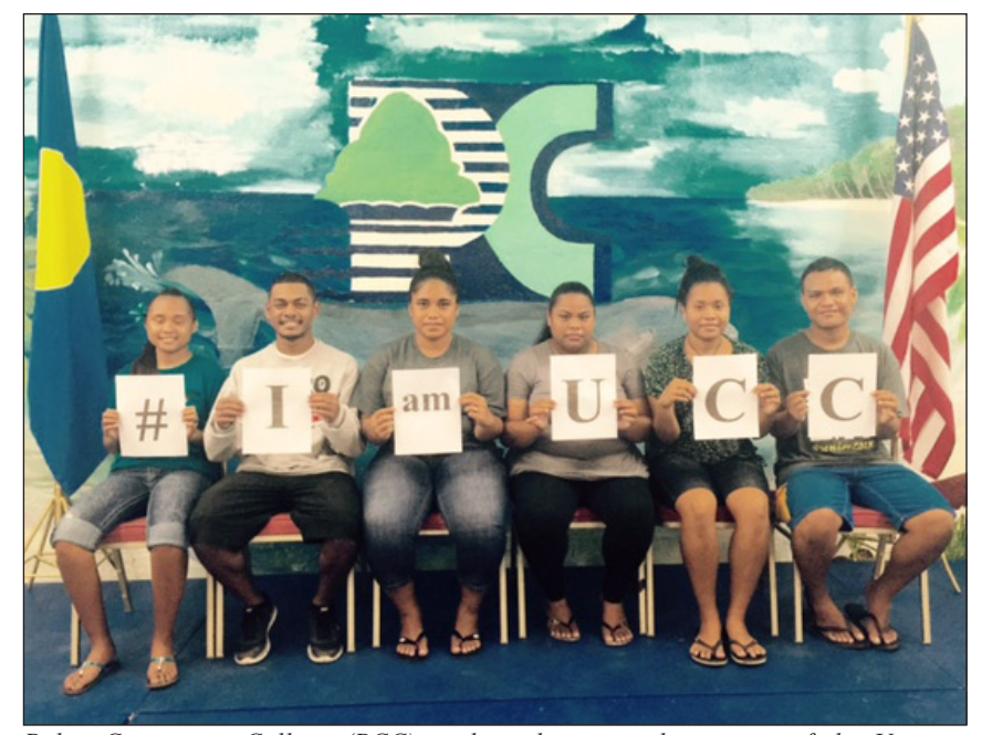
Palau Community College (PCC) students honoring the victims of the Umpqua Community College (UCC) shooting and showing their support for the community of Roseburg, Oregon USA

In light of the recent tragedy that took place on the campus of Umpqua Community College, the American Association of Community Colleges (AACC) and the Association of Community College Trustees (ACCT) have called for a National Moment of Silence as a demonstration of support in honor of the victims.