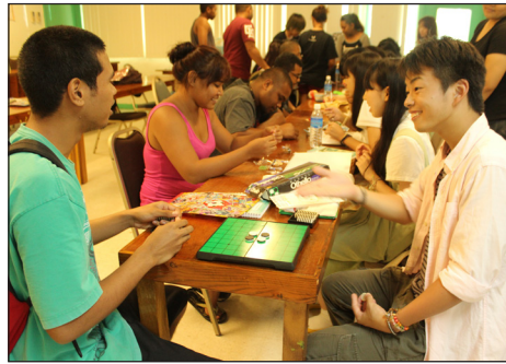
Niigata College student teaching a PCC student how to play "Othello"