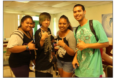
PCC students with a student from Niigata College of Art & Design