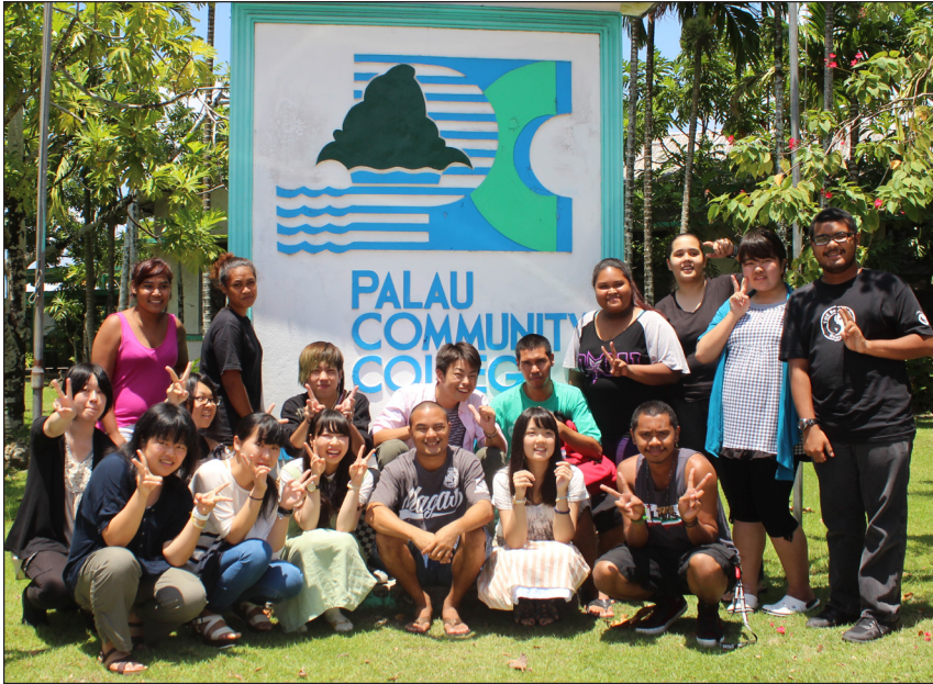
PCC students and the students from the Niigata College of Art & Design