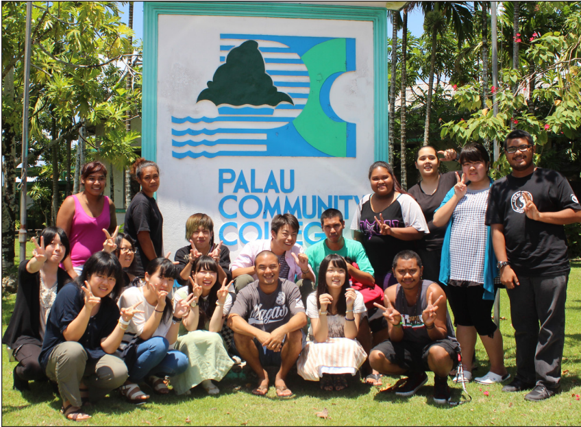
PCC students and the students from the Niigata College of Art & Design