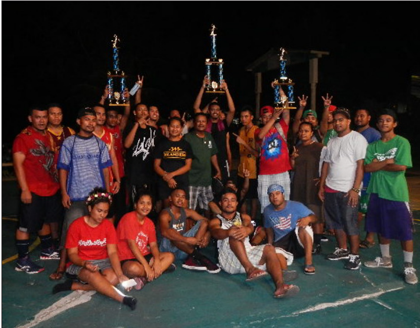
Teams that participated in the PCC Intramural Basketball Game with their trophies

The championship game for the Palau Community College (PCC) Co-Ed Intramural Basketball Tournament was held on Monday, October 26, 2015. The play-off format for the championship game was one-versus-four (1 VS 4). A consolation game for the other teams was also held in a two-versus-three (2 VS 3) format. The basketball games were played at the PCC Basketball Court.