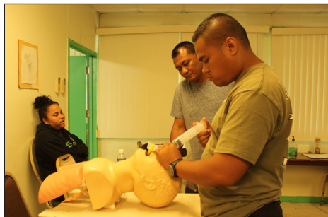
Training participants learning how to use an automated external defibrillator (AED)

Emergency medical technicians are trained to quickly assess and respond to emergency situations. After completing the training, the local emergency responders will be able to apply the methods & skills needed to assess emergency situations and provide the proper medical care needed for traumatic injuries.