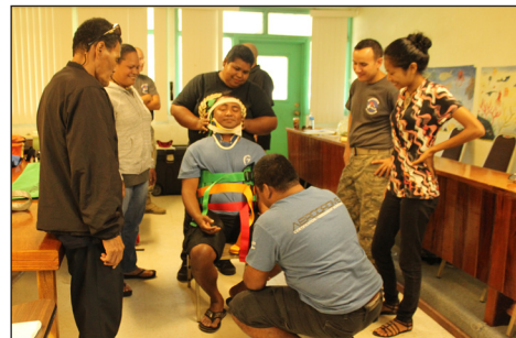
Participants learning how to properly immobilize a patient who is sitting