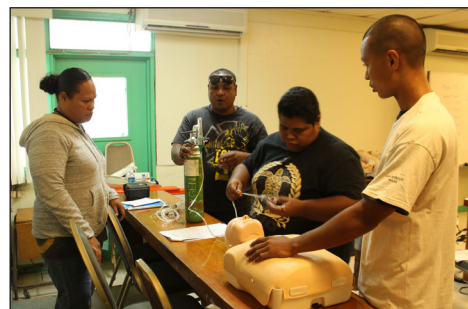
Training participants practicing how to resuscitate a patient