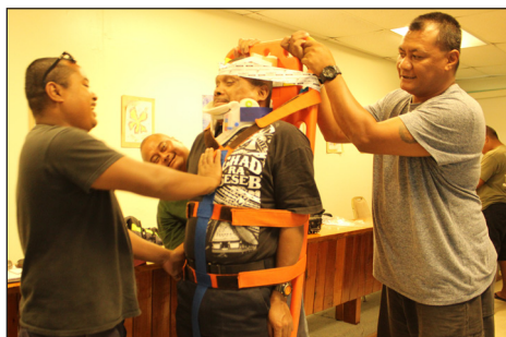
Participants practicing how to immobilize a patient who is in a supine position