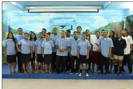
The high school junior participants of the Upward Bound Program