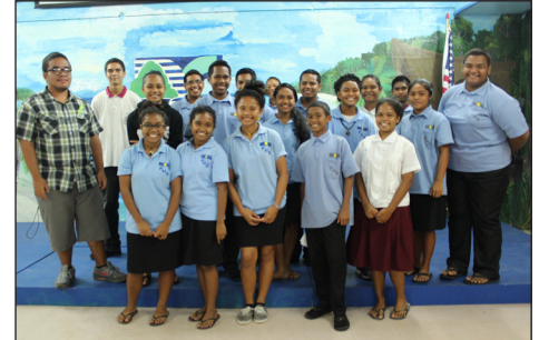
The high school sophomore participants of the Upward Bound Program