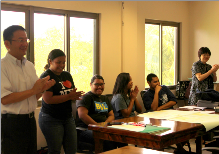
Japanese guest speakers meeting with students from the HI-159 Class