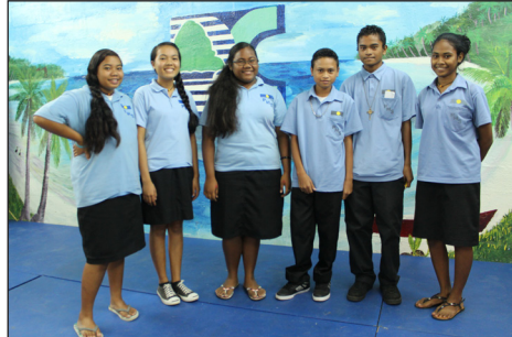
The high school freshmen participants of the Upward Bound Program

The Upward Bound Program provides fundamental support and opportunities for high school students who seek to succeed in their pre-college performance and ultimately their higher education endeavors. Its goal is to increase the rate at which its participants complete their secondary education and enroll in or graduate from institutions of higher education.