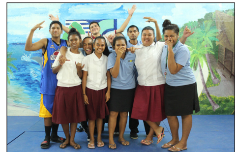
The high school senior participants of the Upward Bound Program