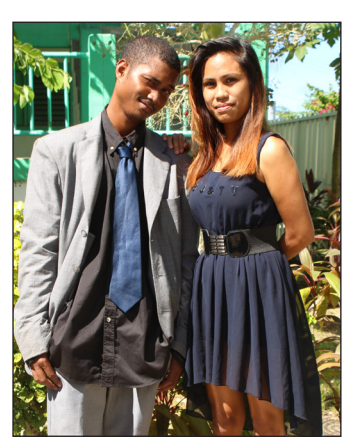
Students wearing their best as part of the ASPCC Spirit Week -"Dress to Impress" Day

The Thanksgiving Day Party was hosted as a show of appreciation to all the students, faculty, and staff members of the college. It was held at the PCC Cafeteria. Entertainment for the evening included dance numbers from the following PCC student organizations: Kosrae, Palau, Pohnpei, and Yap. A live band was also present to add atmosphere to the event. Attendees of the party were given the opportunity to win prizes in a raffle drawing segment of the event.