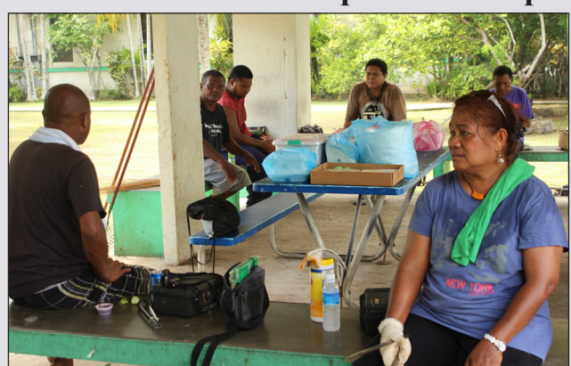
Members of the PCC Classified Staff Organization (CSO) participating in the clean-up of the college campus

As part of their fundraising efforts, the Classified Staff Organization (CSO) of Palau Community College (PCC) recently conducted a clean-up of the college campus. Members of the organization spent an entire day pruning bushes, raking the lawns, water-blasting the walkways, collecting trash, and improving the overall appearance of the campus. CSO would like to recognize & thank all of its members who participated in the campus clean-up. Thank you all for supporting our fundraising efforts! The Classified Staff Organization is a registered non-profit corporate charter committed to fulfilling its civic responsibility by conducting activities that support the community in any way possible.