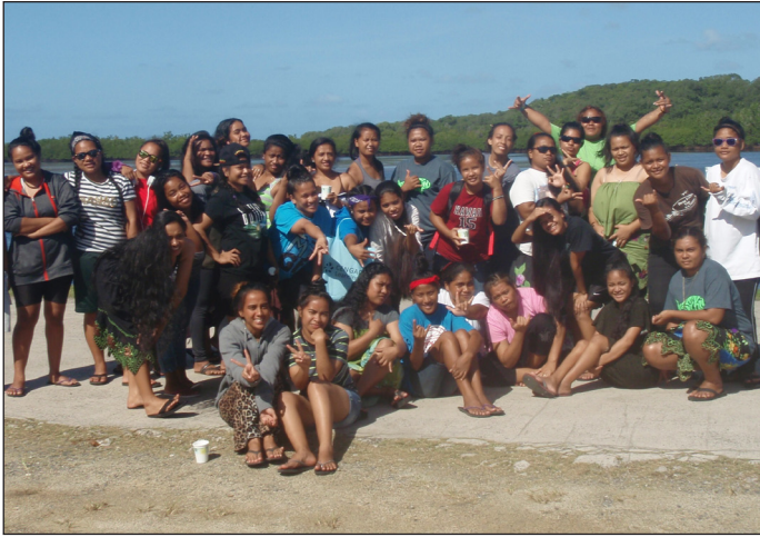
Group photo of the students enjoying their retreat at Ngeremlengui

At the end of the Fall 2015 Semester, the Palau Community College (PCC) Dormitories under the Student Life & Housing Division organized a retreat for its female residents. The retreat was an opportunity for the students to explore a different part of Palau. It was also an opportunity for the students to learn more about each other while away from an academic environment and foster friendships.