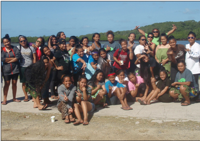
Group photo of the students enjoying their retreat at Ngeremlengui

At the end of the Fall 2015 Semester, the Palau Community College (PCC) Dormitories under the Student Life & Housing Division organized a retreat for its female residents. The retreat was an opportunity for the students to explore a different part of Palau. It was also an opportunity for the students to learn more about each other while away from an academic environment and foster friendships.