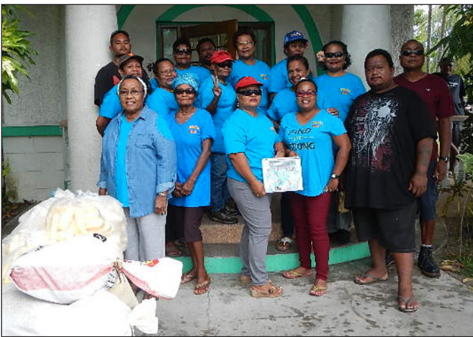
Members of the Ngara Seseb ra Ordovel ra Airai with their donation of coconut and tapioca for the PCC Cafeteria