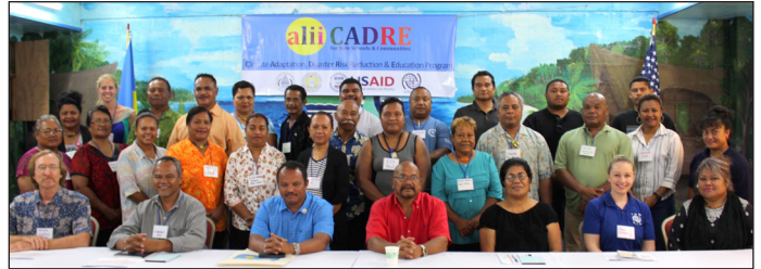
Ministry of Education Workshop Participants