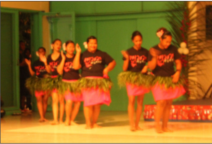
Palau Student Organization Valentine's Day Bash Performance

The Associated Students of Palau Community College (ASPCC) hosted a Valentine's Day Bash on Friday, February 12, 2016. Featured at the event were dance performances by the student organizations and a live band. Participants of the event were entered in a raffle drawing with prizes that included Valentine's Day gifts and airtime. The ASPCC Valentine's Day Bash was an opportunity for the students to socialize outside of an academic setting.