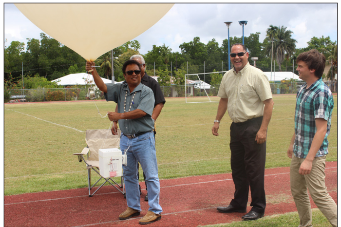
President Tommy E. Remengesau Jr. releasing the weather balloon