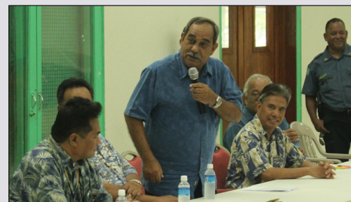
FSM President Peter Christian (standing with microphone) meeting with the FSM students