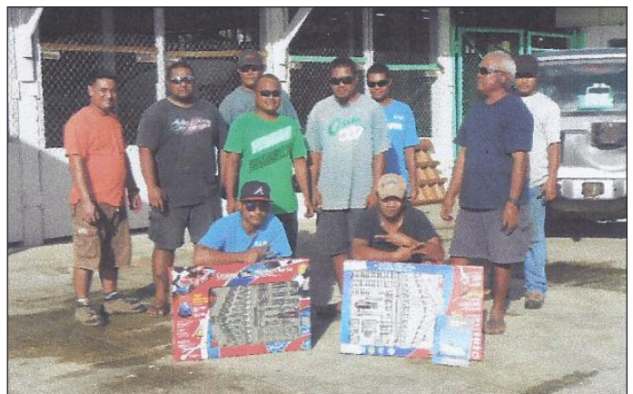
Kayangel and Ngerchelongs State Rangers who participated in the “Boat Safety and Outboard Engine Troubleshooting” Training

The Maintenance Assistance Program at PCC is a short-term training program for state and national government employees, as well as utility employees, in the area of infrastructure operation and maintenance.