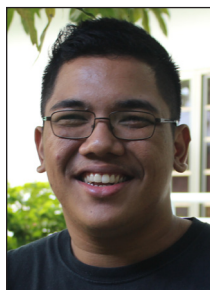
Erikson E. Moses Sandra S. Pierantozzi Scholarship