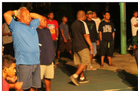
Participants stretching before the event

The 23 rd Charter Day marks the transition date of the Micronesian Occupational Center/College into Palau Community College. Since it began, PCC has continued to help students in Palau and the region of Micronesia reach their potential by providing quality education programs & services. PCC remains Palau's only institution of higher learning that produces students who contribute to their communities.