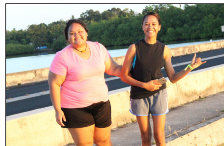
PCC students walking the course