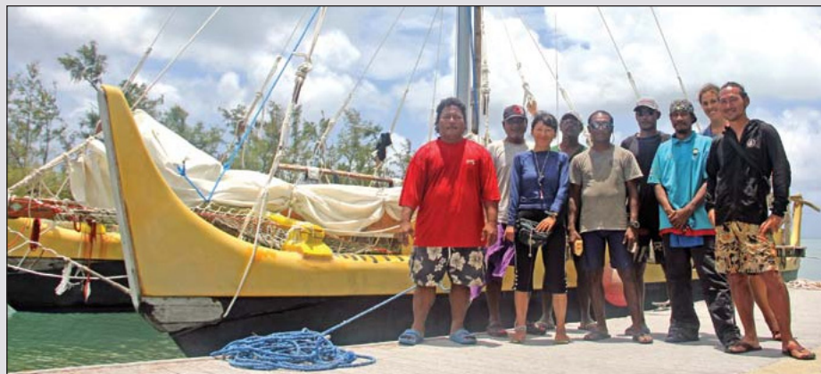
Alingano Maisu and its crew members arriving in Saipan