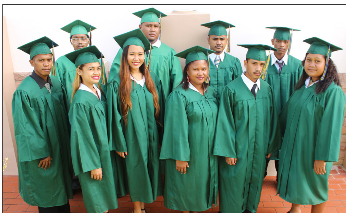
PCC Adult High School - Class of 2016