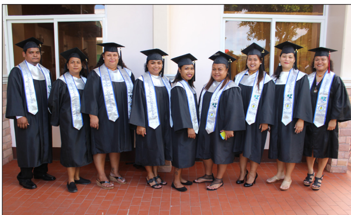
Substance Abuse Treatment Counseling