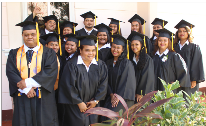
School of Business