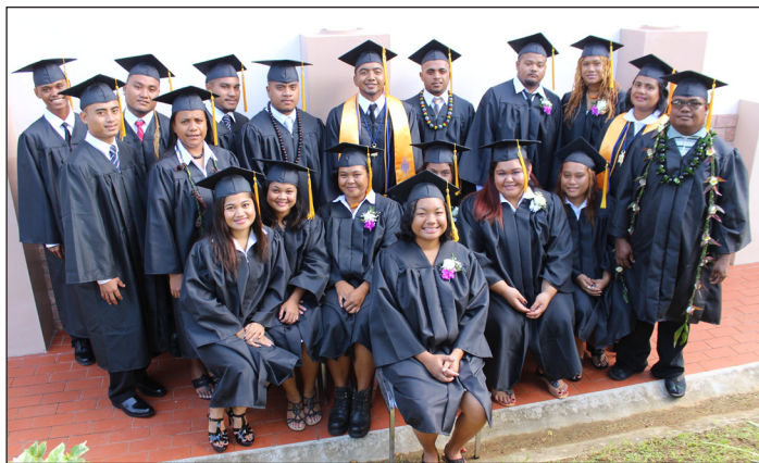
School of Arts & Sciences