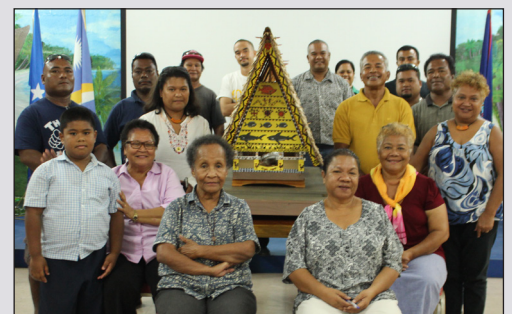
Group photo of the committee members and the men who built the miniature abai

Reviews of Palau's participation in the upcoming 2016 Festival of Pacific Arts (FestPac 2016) were recently held at Palau Community College (PCC). The first review covered the building techniques & structural significance of the abai , the Palau traditional meeting house for men. The men sharing information about this aspect of Palau's culture will also showcase a miniature abai that they built. A review of the literary presentations of Palau was held on May 13, 2016 at the Tan Siu Lin PCC Library. The literary committee covers the following aspects of the Pacific cultures: fashion (modern & traditional), history, indigenous languages, oratory, publications, and theater. Festival activities under this category include poetry reading, storytelling, book sales, and fashion shows. The delegation from Palau arrived in Guam on Thursday, May 19, 2016 for the Festival of Pacific Arts.