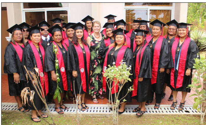
San Diego State University - Bachelor of Arts in Education