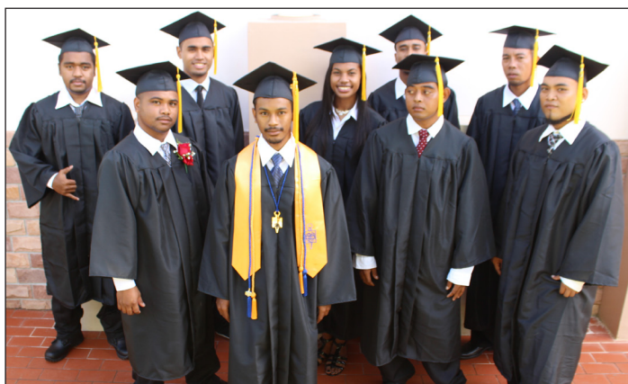
School of Technical Education