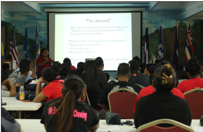
LRC CRE Agriculture Presentation held at the PCC Assembly Hall