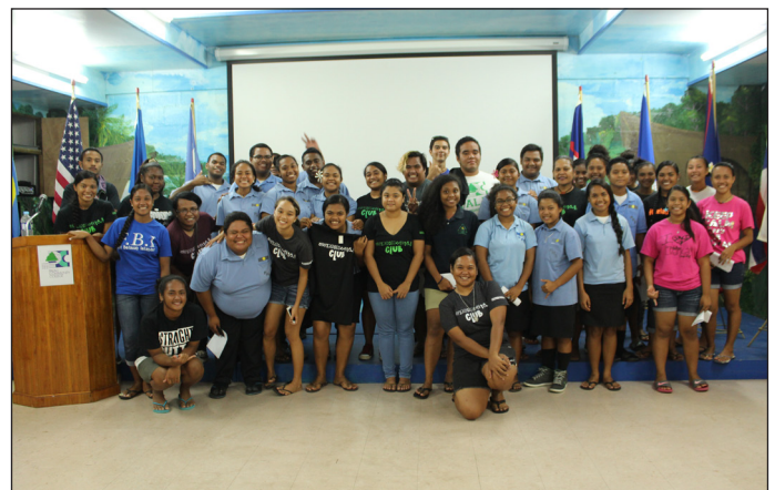
Group Photo of high school students in the Upward Bound Program and the EMS & STEM students who hosted the presentation

The STEM Disciplines is an associate of arts degree program designed for students who are interested in professional careers in the fields of science, technology, engineering, or mathematics. The program provides basic knowledge and skills focused on subject areas of mathematics & science. Career opportunities for students who graduate from the STEM Disciplines Program include becoming engineers or scientists.