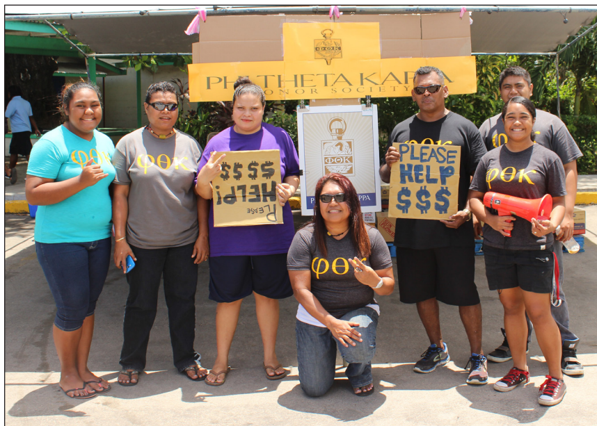
Members of the PTK - BOZ hosting their Project Graduation: Food Drive event at the PCC Parking Lot

On Friday, May 06, 2016 members of the Phi Theta Kappa International Honors Society (PTK) - Beta Omicron Zeta (BOZ) Chapter held a food drive for their Project Graduation event. The project graduation is an annual event held by the PTK-BOZ members as part of their service to the community. This year, the students hosted a food drive inviting members of the community to donate non-perishable food items, such as canned goods.