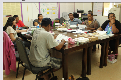
Student Life & Housing staff attending a training session for the TracDat® Program

On Tuesday, April 26, 2016 and Monday, May 09, 2016 two (2) training sessions were conducted with the staff of the Student Life & Housing Unit of Palau Community College (PCC). The sessions focused on preparing the staff for the implementation of the TracDat® Phase II that will occur this coming fall semester (Fall 2016). The two-day training covered the following components important for the TracDat® Program: mapping of the service area outcomes to Institutional Learning Outcomes (ILOs); 15-Year Institutional Master Plan Strategic Directions Goals & Objectives; ACCJC Standards & Eligibility Requirements; and the Institutional-Set Standards. This training will also be provided to all non-instructional & non-academic service areas of the college in order to prepare all the divisions/service areas for the program's implementation phase this coming fall. TRAINING, CONTINUED ON PAGE 3