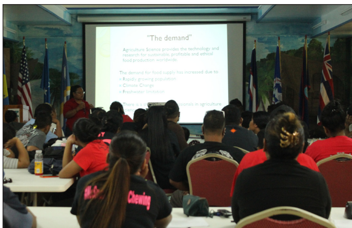
LRC CRE Agriculture Presentation held at the PCC Assembly Hall