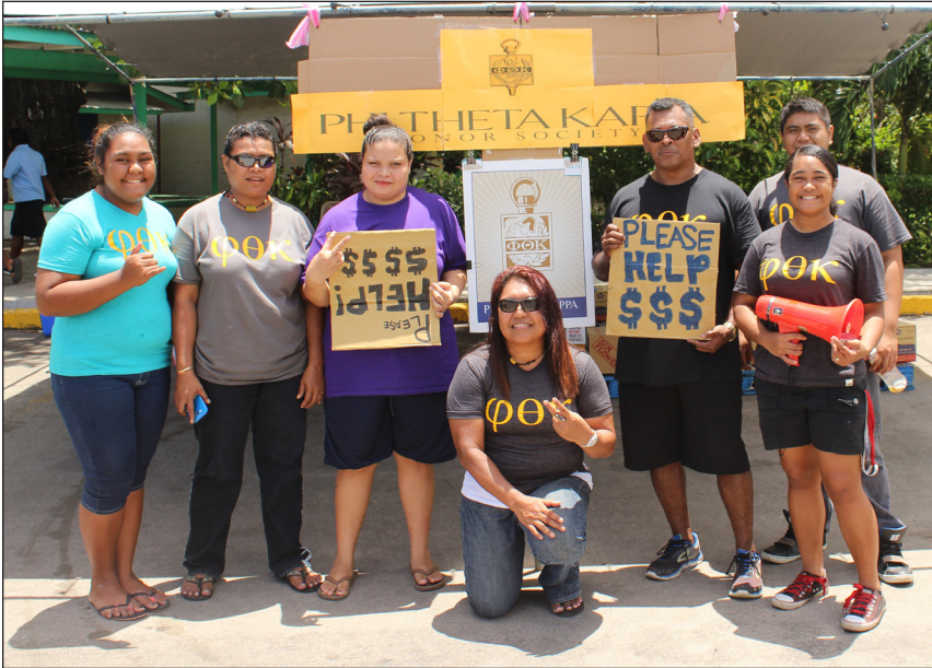
Members of the PTK - BOZ hosting their Project Graduation: Food Drive event at the PCC Parking Lot

On Friday, May 06, 2016 members of the Phi Theta Kappa International Honors Society (PTK) - Beta Omicron Zeta (BOZ) Chapter held a food drive for their Project Graduation event. The project graduation is an annual event held by the PTK-BOZ members as part of their service to the community. This year, the students hosted a food drive inviting members of the community to donate non-perishable food items, such as canned goods.