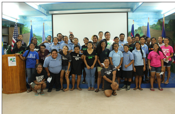
Group Photo of high school students in the Upward Bound Program and the EMS & STEM students who hosted the presentation

The STEM Disciplines is an associate of arts degree program designed for students who are interested in professional careers in the fields of science, technology, engineering, or mathematics. The program provides basic knowledge and skills focused on subject areas of mathematics & science. Career opportunities for students who graduate from the STEM Disciplines Program include becoming engineers or scientists.