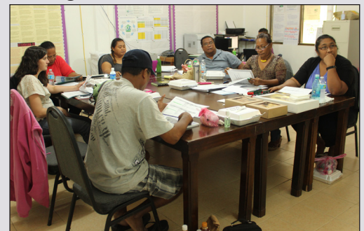
Student Life & Housing staff attending a training session for the TracDat® Program

On Tuesday, April 26, 2016 and Monday, May 09, 2016 two (2) training sessions were conducted with the staff of the Student Life & Housing Unit of Palau Community College (PCC). The sessions focused on preparing the staff for the implementation of the TracDat® Phase II that will occur this coming fall semester (Fall 2016). The two-day training covered the following components important for the TracDat® Program: mapping of the service area outcomes to Institutional Learning Outcomes (ILOs); 15-Year Institutional Master Plan Strategic Directions Goals & Objectives; ACCJC Standards & Eligibility Requirements; and the Institutional-Set Standards. This training will also be provided to all non-instructional & non-academic service areas of the college in order to prepare all the divisions/service areas for the program's implementation phase this coming fall. TRAINING, CONTINUED ON PAGE 3