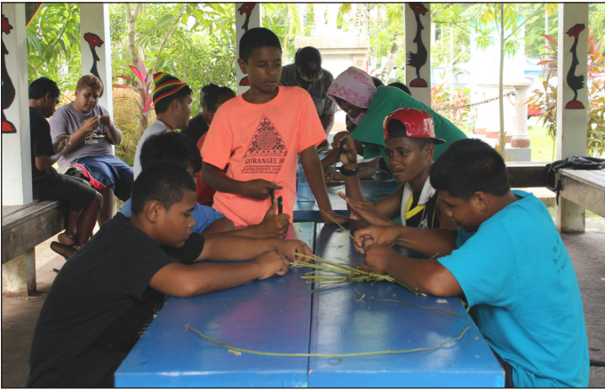
Students learning to weave traditional fish traps

The first day of classes for the 2016 Summer Kids Program under the Continuing Education (CE) Division of Palau Community College (PCC) was Monday, June 06, 2016. Over a four-week period, elementary school students will participate in various cultural & education activities designed to enhance their learning abilities. Subjects covered in the summer classes offered this year include mathematics (with an emphasis on Singapore math), English reading & writing, Palauan orthography, marine/environmental science, music, and art. 2016 SUMMER KIDS, CONTINUED ON PAGE 3