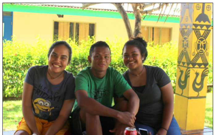
Students enjoying their first week of the summer semester

Monday, June 06, 2016 marks the first day of instruction for the 2016 Summer Semester of Palau Community College (PCC). New & returning students met with their academic advisors at the Student Life Office to finalize their academic schedules for the new semester. SUMMER SEMESTER, CONTINUED ON PAGE 4