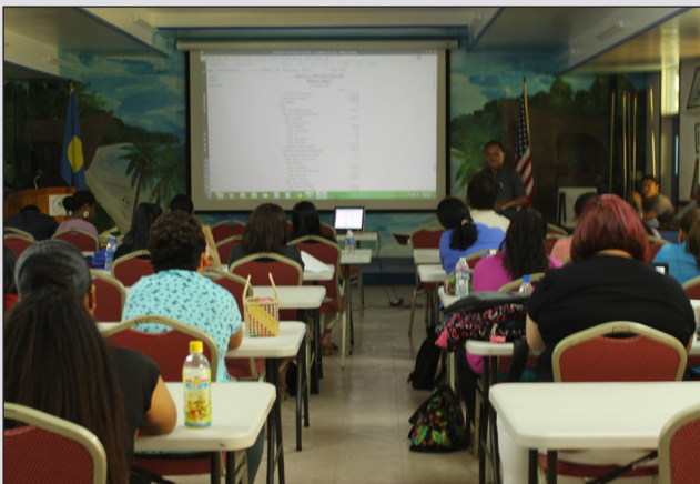
Auditors participating in a workshop at the PCC Assembly Hall

A workshop for auditors was currently hosted at the Assembly Hall of Palau Community College (PCC). Auditors who participated in the workshop reviewed the basic concepts of auditing in order to provide accurate data and information when conducting their work. In addition, a review of the ethnic obligations of auditors, especially in regards to government funds, was addressed. The workshop was a step towards improving the work ethics and policies of Palau's auditors.