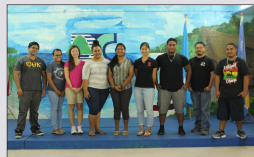
Students participating in the 2016 CariPac Summer Internship Program

Students participating in the Caribbean and Pacific Consortium (CariPac) Summer Internship Program recently arrived on the campus of Palau Community College (PCC). The students will be spending the summer learning about the PCC Agriculture Science Program as well as the studies & researches being conducted by the PCC Cooperative Research & Extension (CRE) Department. The participating students are from higher education institutions in the Northern Mariana Islands, American Samoa, U.S. Virgin Islands, the Federated States of Micronesia, the Marshall Islands, and Palau. CariPac supports the researches and education opportunities that help address local food, agricultural, and environmental needs; local economic growth; and the preparation of students in reaching their own personal career goals, especially in the field of agricultural science. PCC extends its welcome to all the students participating in the program!