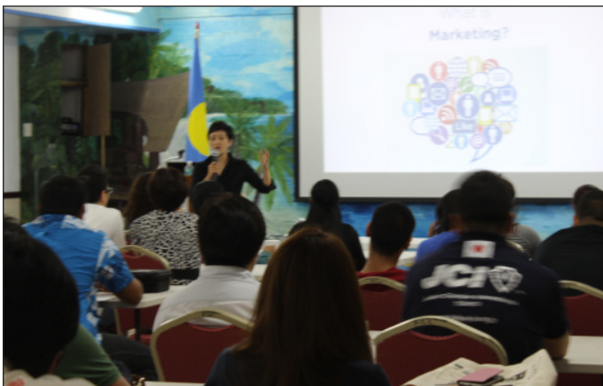
JCI - Tokyo representative explaining the concept of marketing in the business world

The JCI - Tokyo is a non-political and non-sectarian youth service organization. It conducts various activities designed to enrich societies across the world through partnerships formed with citizens, corporations, and the administrative agencies. The activities sponsored by JCI - Tokyo support social development, especially of young leaders who will influence future generations. The organization is committed to influencing the world in a positive way through global communities and self-improvement. In support of Palau's partnership with Japan, the JCI - Tokyo also hosted the night market at Ernguul Central Park on Friday, June 25, 2016 in collaboration with the Palau Visitors Authority (PVA).