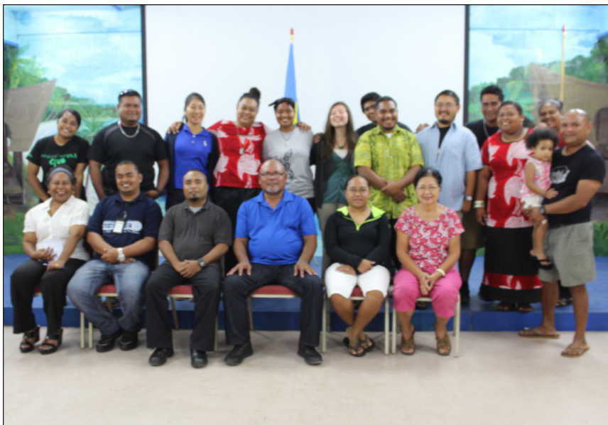
2016 CARIPAC Summer Internship Program students with their sponsor agencies

On Friday, June 24, 2016 the students who participated in the 2016 Caribbean and Pacific (CariPac) Summer Internship Program held presentations at the Assembly Hall of Palau Community College (PCC). Each presentation was a highlight of the summer's agricultural and food sciences activities that were experienced in Palau. The students also included the lessons they had learned about Palau's environmental and marine conservation efforts.