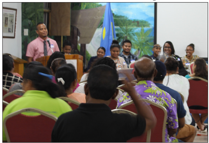
PNSB Internship Student sharing his summer work experience

The Palau National Scholarship Board (PNSB) held its first internship forum at the Assembly Hall of Palau Community College (PCC) on Thursday, July 07, 2016. The internship forum featured students who had participated in the 2016 Palau Fellowship Award Program. PNSB INTERNSHIP FORUM, CONTINUED ON PAGE 4