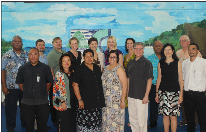
The Accreditation External Team that visited the college earlier this year