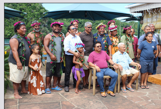
Alingano Maisu crew welcomed back to Palau