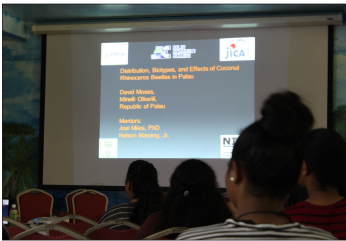
STEP-UP student research presentation about coconut rhino beetles

On Friday, July 08, 2016 student researchers who participated in the Short-Term Research Experience for Underrepresented Persons (STEP-UP) Summer Program held presentations about their researches at the Palau Community College (PCC) Assembly Hall. Each presentation showcased the student's project background, research methods, and findings.