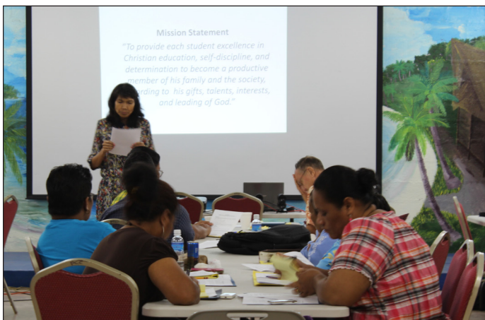
Staff and faculty members of Emmaus & Bethania High School reviewing the school's mission statement and educational goals

This week, a convocation between representatives from Emmaus High School and Bethania High School was held at the Assembly Hall of Palau Community College (PCC). The administration, staff, and faculty members of both schools attended the general meeting to discuss plans related to the merging their campuses. CONVOCATION, CONTINUED ON PAGE 3