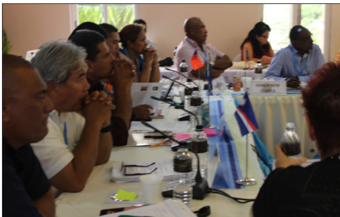
Participants of the forum discussion held at the PTHSE

Palau hosted the 13 th Pacific Public Service Commissioners' Conference (PPSCC) from Tuesday, August 02, 2016 to Thursday, August 04, 2016. The conference was organized by the Bureau of Public Service System under the Palau Ministry of Finance in collaboration with the Pacific Island Center for Public Administration (PICPA) of the University of the South Pacific. It was an opportunity for a cross-jurisdictional forum among the Public Service Commissioners of the Pacific islands to discuss current issues facing the public sectors. PPSCC, CONTINUED ON PAGE 4